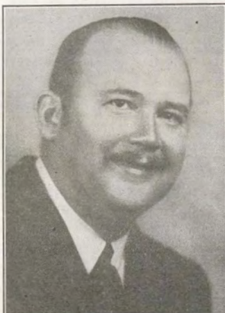
PAUL WHITEMAN NBC—7 P. M.