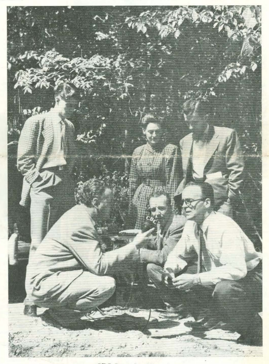
CBC Saturday Magazine

Taking July 15 as an example: on this occasion Saturday Magazine will last for three hours and