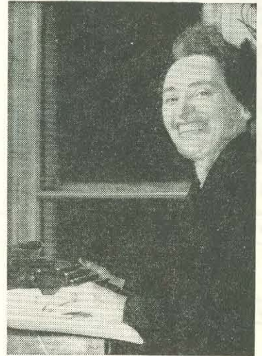
Helen Creighton Canadiana