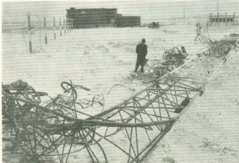
Wreckage of the upper portion of CBW's transmitter tower, southwest of the tuning house. Transmitter building in the background.

This was the sequence of events: February 4, noon, a Beechcraft air-