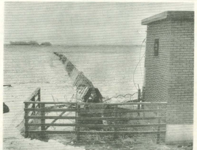
The 500-foot lower portion of the CBW antenna lies broken on the open prairie east of the tuning house. Snapped guy wires, an extreme danger to men on the ground when the tower fell, can be seen on either side.