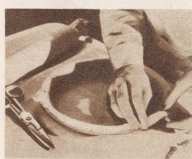
For fluted rim, make double upright 3 fold of pastry.