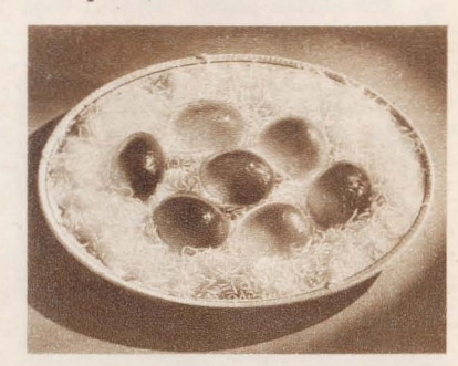
These colorful Easter eggs in their nest of Baker's Coconut were made with three flavors of the new extra-rich Jell-O — Strawberry, Orange, and Lime.

Jell-O Easter Eggs-Make a hole about as large as a lead pencil in small end of egg. With long needle mix yolk and white so they come out easily. Rinse shells with cold water. Dissolve different flavors of Jell-O, using one pint warm water for each package. Fill eggshells with Jell-O, using funnel. Set on end in egg container. Chill until firm. When ready to serve, break away shells. Serve in nests of whipped Jell-O, or Baker's Coconut. Garnish with small candy eggs or fruits cut in small pieces, if desired.