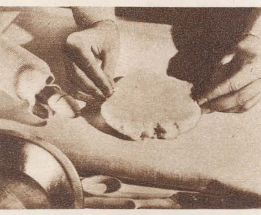
Roll chilled pastry, pinching edge together if it cracks.