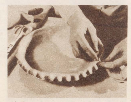
Your fingers can make a pretty fluted rim in no time.