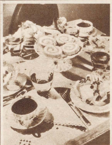
For simple entertaining serve a bridge luncheon on the card table. Serve the rolls with the salad, pass the coffee in the cups, and use the dessert for a centerpiece.

Imperial Pear Salad* Sanka Coffee Cheese and Crackers *Bulletin No. 16