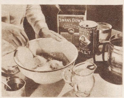
Add water to form dough that is neither sticky nor dry.

Follow these rules for Perfect Pie Crust