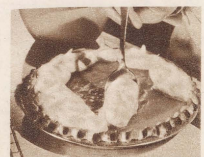
Pile a meringue lightly from edge in, pushing it into each crinkle.