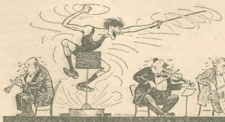
JOHNNY GREEN, conductor of a radio orchestra, indulges in all sorts of strenuous gestures when he leads his band. So he dresses the part and wears his collar open, a sleeveless sweater and linen trousers.