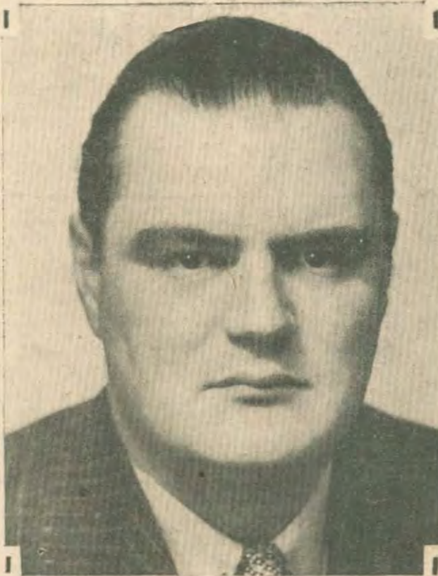
COLONEL LEMUEL QUITZ STOOPNAGLE, eminent naturalist and photographer, comes out of hiding in lower Manhattan and tells us how to take pictures at home. The Colonel's radio appearances are made on Tuesday and Thursday evenings at 10.

Well, the photographer announces from the dark room that at last the pictures are ready. He comes out pretty much of a mess carrying some limp prints. They are all black for the photographer has developed an unexposed film. The children are surprised. Father says "Shucks!"