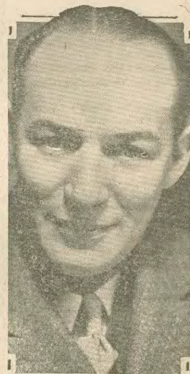
TED HUSING, announcer who frankly and freely admits that he's good.