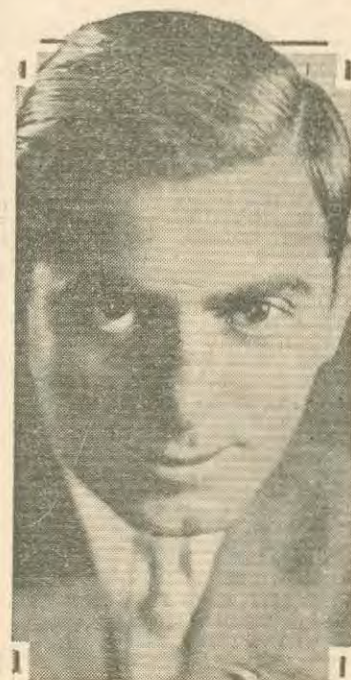
EDDIE CANTOR who wise-cracks off the stage as well as on it.