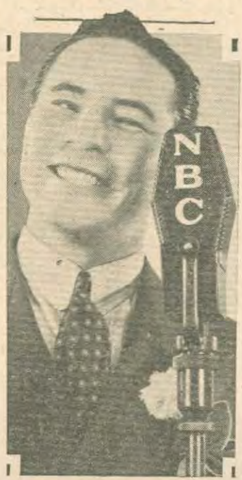
MAX BAER, contender for heavy-weight boxing championship, now is starred in a three-a-week series of dramas on Mondays, Wednesdays and Fridays at 7.45 P.M. over the NBC-WJZ network.