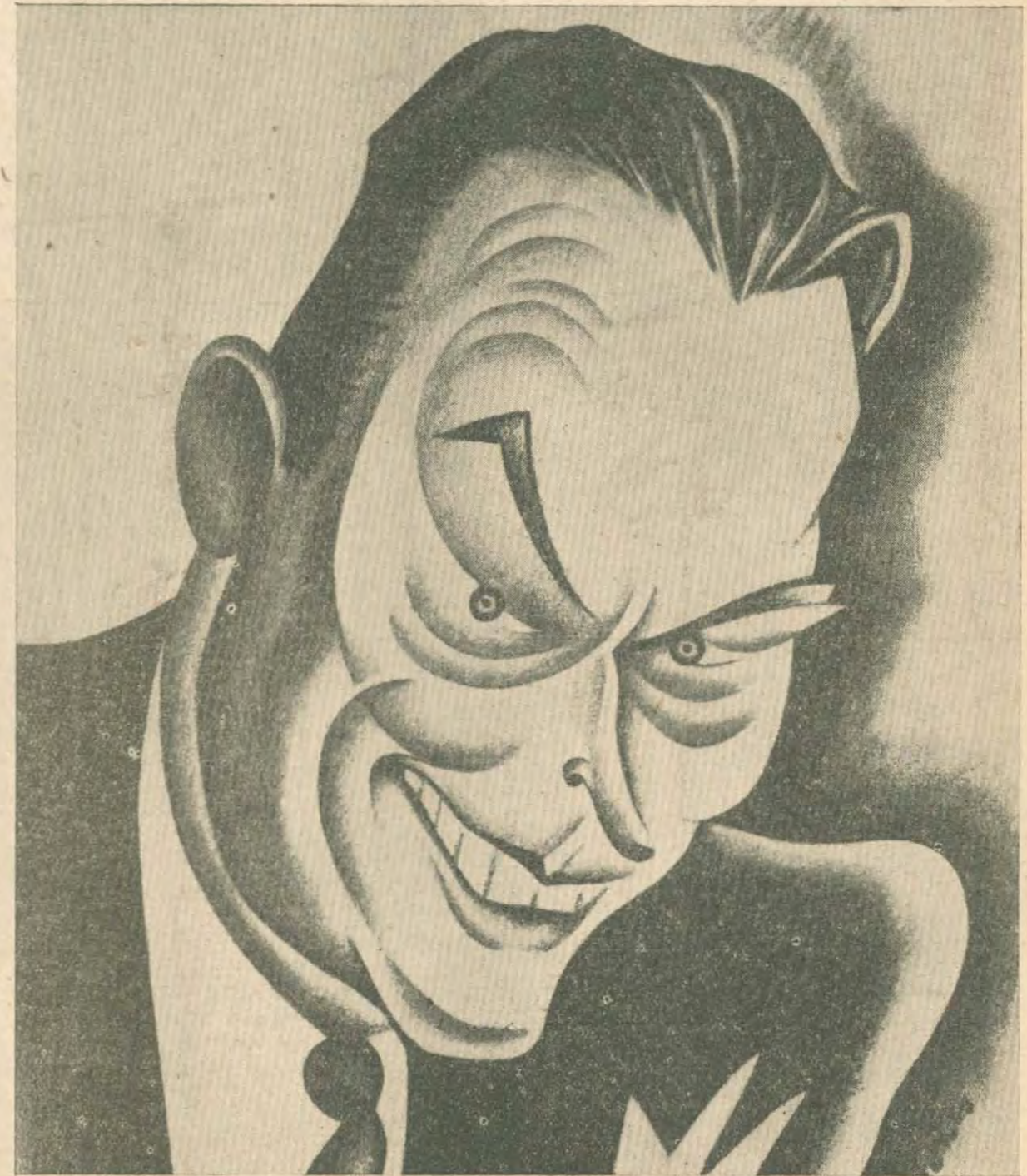
Fred Allen, NBC Comedian, A Caricature