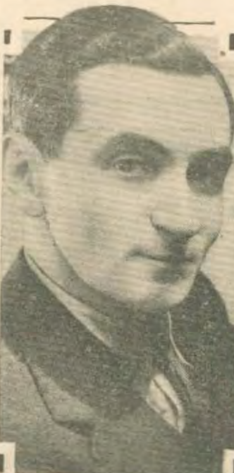
IRVING BERLIN, famous composer of popular songs who now talks about them and sings some Sunday nights at 9 on the NBC-WJZ network.