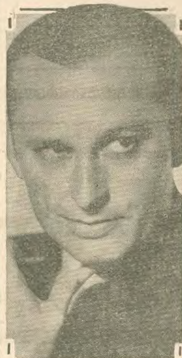
BEN BERNIE, the "Old Maestro," who lends a patient ear to his friends of the radio audience.