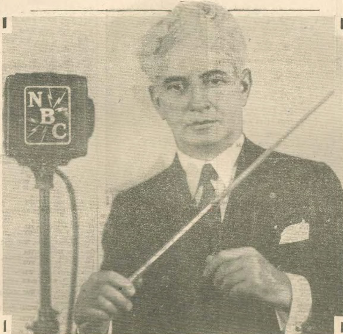
EDWIN FRANKO GOLDMAN, well-known band leader, whose concerts are broadcast three times a week over the NBC network.

tween the methods of the two different musical groups gave him an idea.