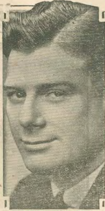
ARTHUR GODFREY, CBS announcer who is heard on a good many popular programs.