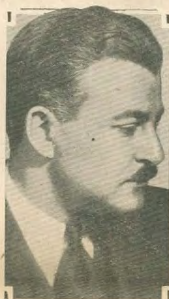
ARTHUR FIEDLER, conductor of the Pops and Esplanade concerts in Boston.

movement from a Beethoven symphony or a Mozart overture for the others.