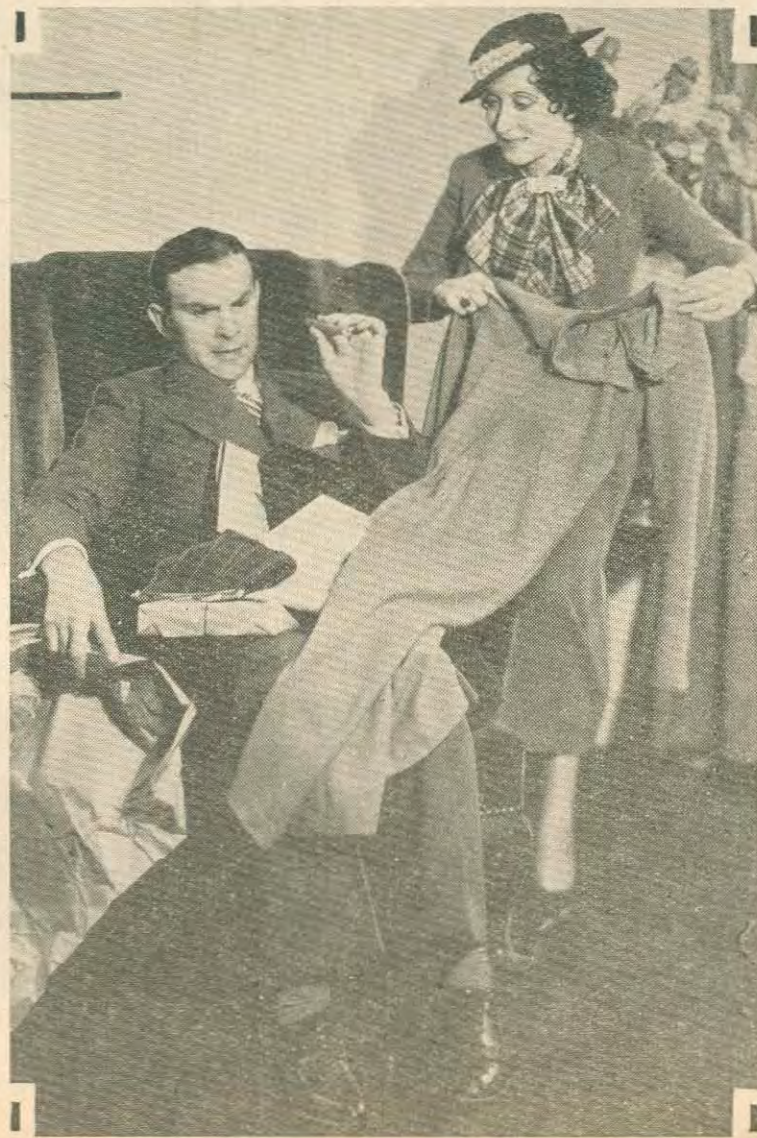
GEORGE BURNS and GRACIE ALLEN argue over a bit of luggage which they are taking on their long trip through Europe and look at the clothes GRACIE has bought with the money they are going to make after they return from Europe.

GEORGE (ignoring his wife for the moment): From Budapest we travel to War-