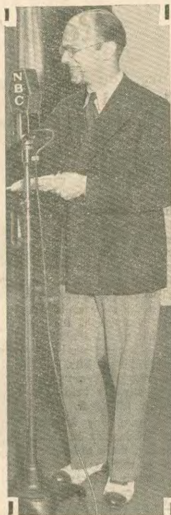
DEEMS TAYLOR, American composer who acts as master-of-ceremonies on the NBC PAUL WHITEMAN programs, broadcast Thursdays at 10 P.M.