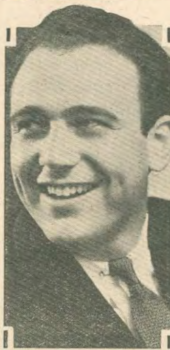
JOHNNY GREEN, alert young composer and conductor who presents programs called "In the Modern Manner" Fridays at 9.30 P.M. on the CBS chain.