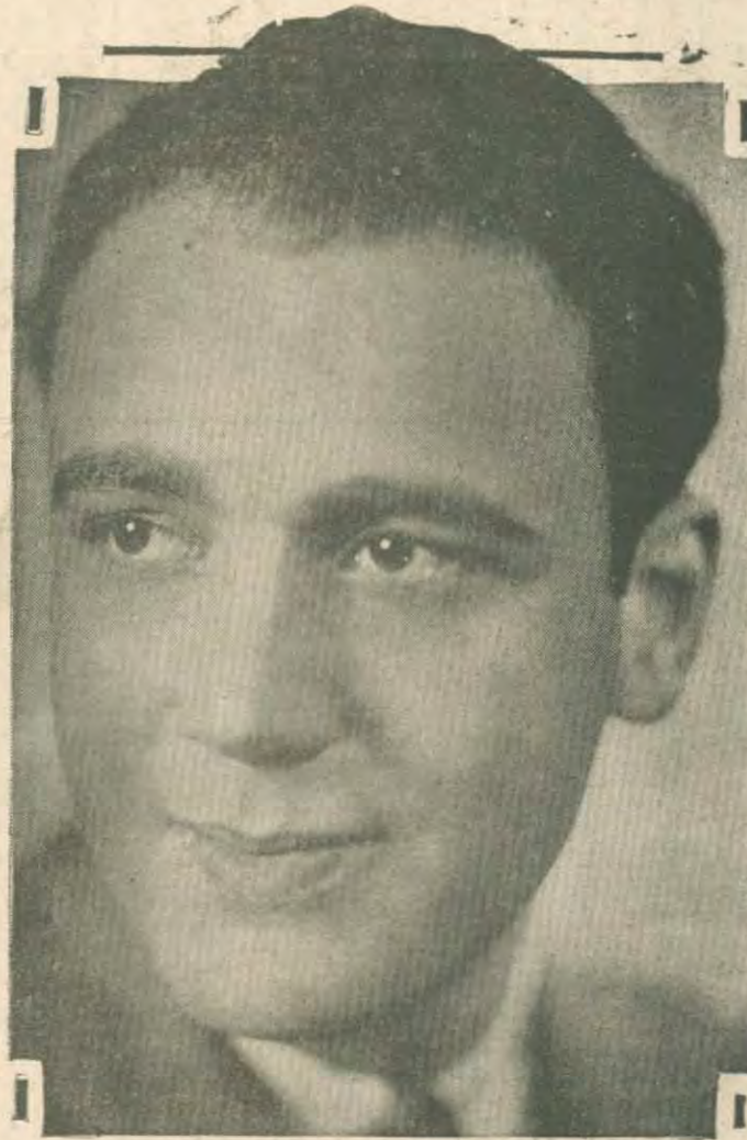
JOHNNY GREEN, one of the musical directors of the Columbia Broadcasting System, who is heard in his own program on Fridays at 9.30 P. M. Mr. GREEN tells something of modern music on the air in the accompanying article.

I'm going after my crusade for excellent musical entertainment with perhaps too much youthful optimism.