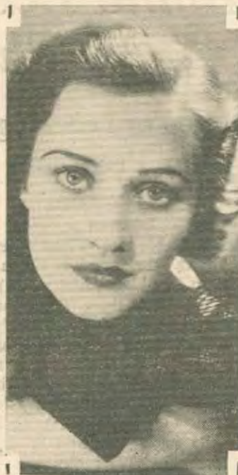
JANE FROMAN, who appeared in the "ZIEGFELD FOLLIES" this year, is one of Columbia's most popular and comely vocalists.