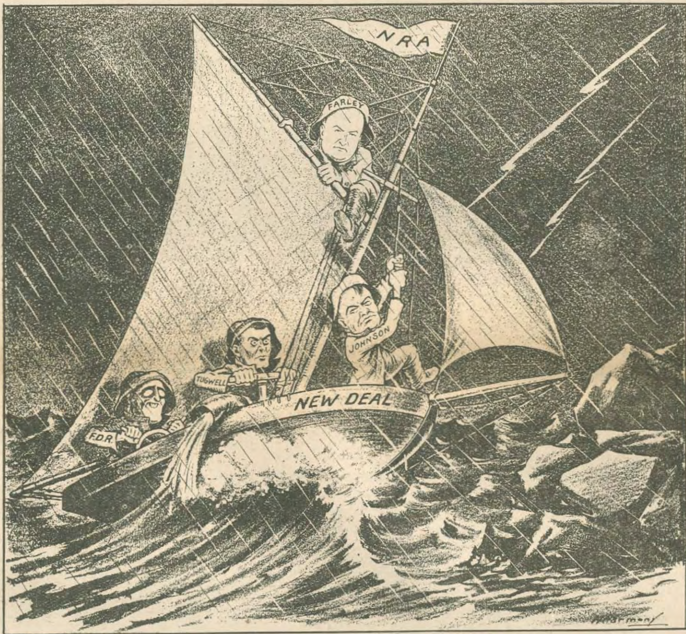
Can They Keep Her Off The Rocks?

Circulation Manager, NOW, No. 34 Court Square, Boston, Massachusetts.