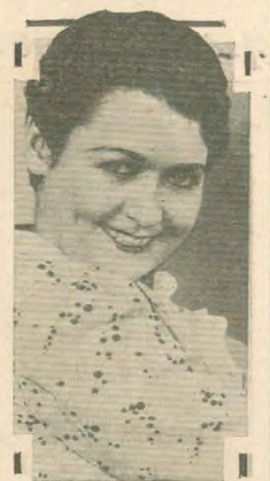
GRACE HAYES, of musical comedy, movies and vaudeville, is featured on the NBC-WJZ show Sundays at 8 P.M. She also offers recitals Tuesdays and Wednesdays at 7.45 P.M., and on Sundays at 2.30 on the WEAF chain.