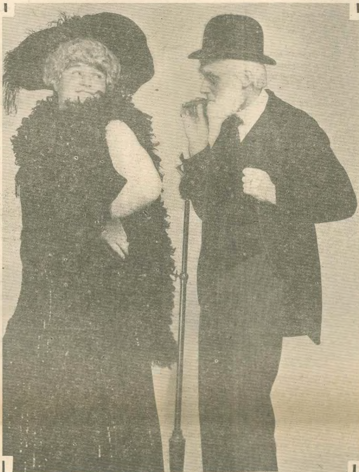
COLONEL LEMUEL Q. STOOPNAGLE and PARKER FENNELLY. The former is the author of the "Stooperettas." The latter plays the part of FRANK CRUMIT's down-East Uncle ABNER, both on the Spotlight Revue on Fridays at 10 P. M. over the CBS network.

Born" continues his characteristic interpretations of popular and semi-classic hits in this new Columbia series. This engagement has caused him to cancel his plans for his Summer trip to Europe, which he has made annually since 1923, when he went abroad to study under outstanding European teachers as a protege of Mr. and Mrs. JOHN J. RASKOB.