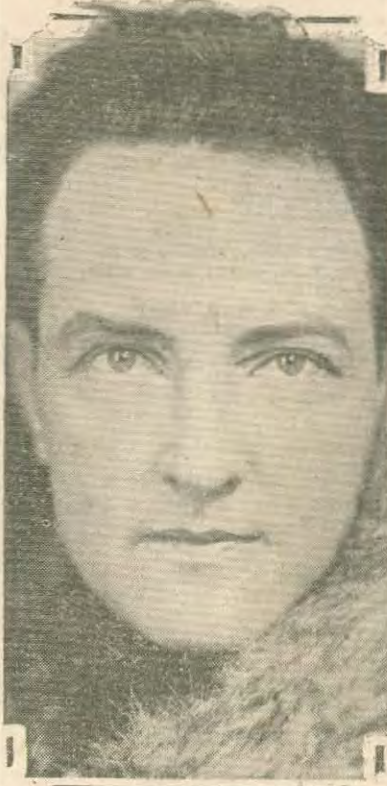
ADMIRAL RICHARD E. BYRD, commander of the South Polar expedition.

pierced the Arctic Circle he began making tests to study the atmospheric conditions of the locality and to determine the spot from which his signals are best received along the Western coast of the United States.