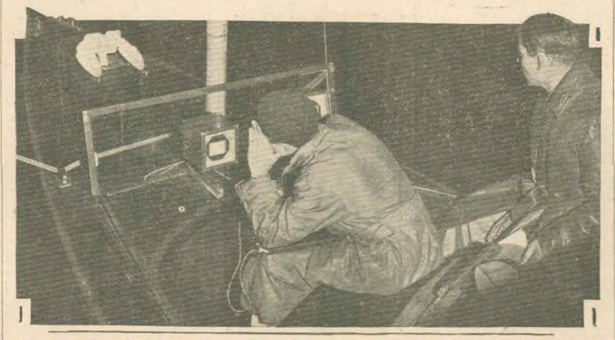
THE BRITISH BROADCASTING Corporation sets up its paraphernalia to broadcast an evening sporting event on the London river.

the printed word should crush Press, there are not wanting way, the consequences to broadcasting might have been dam-