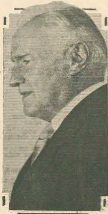
DR. WALTER DAMROSCH conducts the Music Appreciation Hour over the WEA and WJZ chains on Fridays at 11 A. M.

ning of its seventh season, Dr. DAMROSCH discusses and offers illustrations of orchestral instruments, forms of music from the folk-song to the symphony, and masterworks of the world's greatest composers from PALESTRINA to STRAVINSKY.