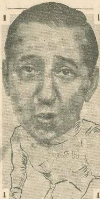
LOU HOLTZ, Broadway comedian, has won acclaim for his appearances on the RUDY VALLEE programs, heard Thursdays at 8 P.M., on the NBC-WEAF network.