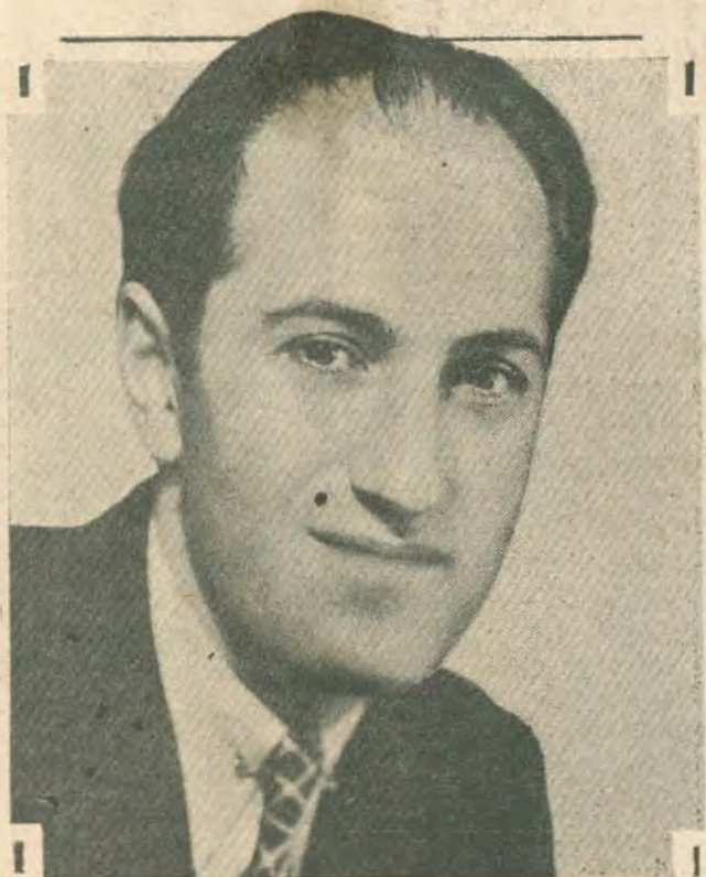
GEORGE GERSHWIN, composer who is featured on a program called "Music by GERSHWIN" that is broadcast over the CBS-WABC network Sundays from 6 to 6.30 P. M.

That, of course, isn't all he does in his Riverside Drive apartment. He composes feverishly. And the black and white keys of his perfectly tuned grand piano have all the lure and challenge of the installment upright which first laid a spell over him on the East Side.