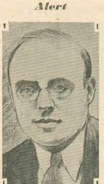
Alert ANDRE KOSTELANETZ directs the orchestra for the concerts on which ROSA PONELLE, NINO MARTINI and GRETE STUECK-GOLD are starred Mondays, Wednesdays and Fridays respectively over the CBS-WABC chain at 9 P.M.