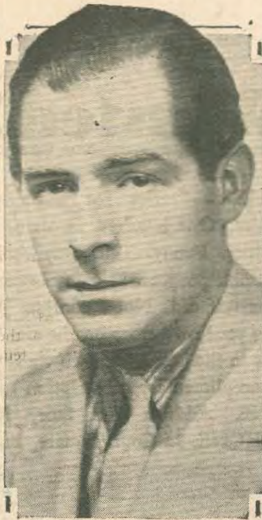
EMERY DEUTSCH, orchestra conductor, leads his gypsy group in programs over the CBS-WABC chain during the week.