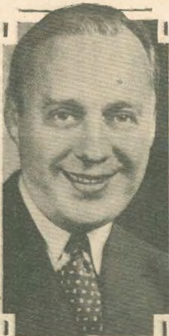
JACK BENNY, popular comedian, begins a new series over the NBC-WEAF network on Sunday, October 14, at 7 P. M.