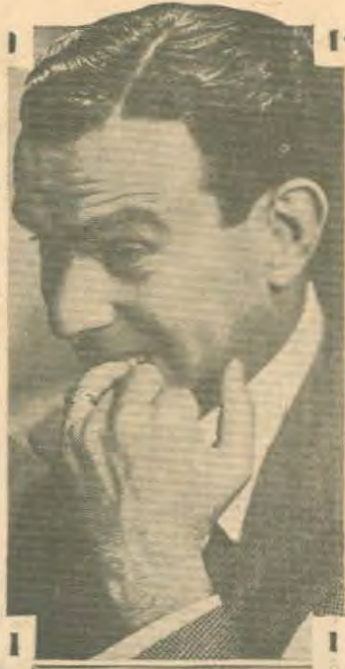
GEORGE BURNS takes it on the chin from GRACIE ALLEN each Wednesday night at 9.30 on the CBS WABC network during the "Adventures of Gracie" program.