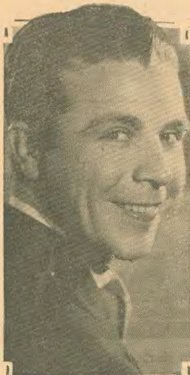
DICK POWELL, star of the "Hollywood Hotel" programs.

at West Point, and his return to the Coast to begin rehearsing for "Hollywood Hotel" broadcasts.