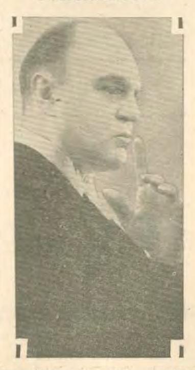
and America, offers programs in which European dance rhythms are blended with American.