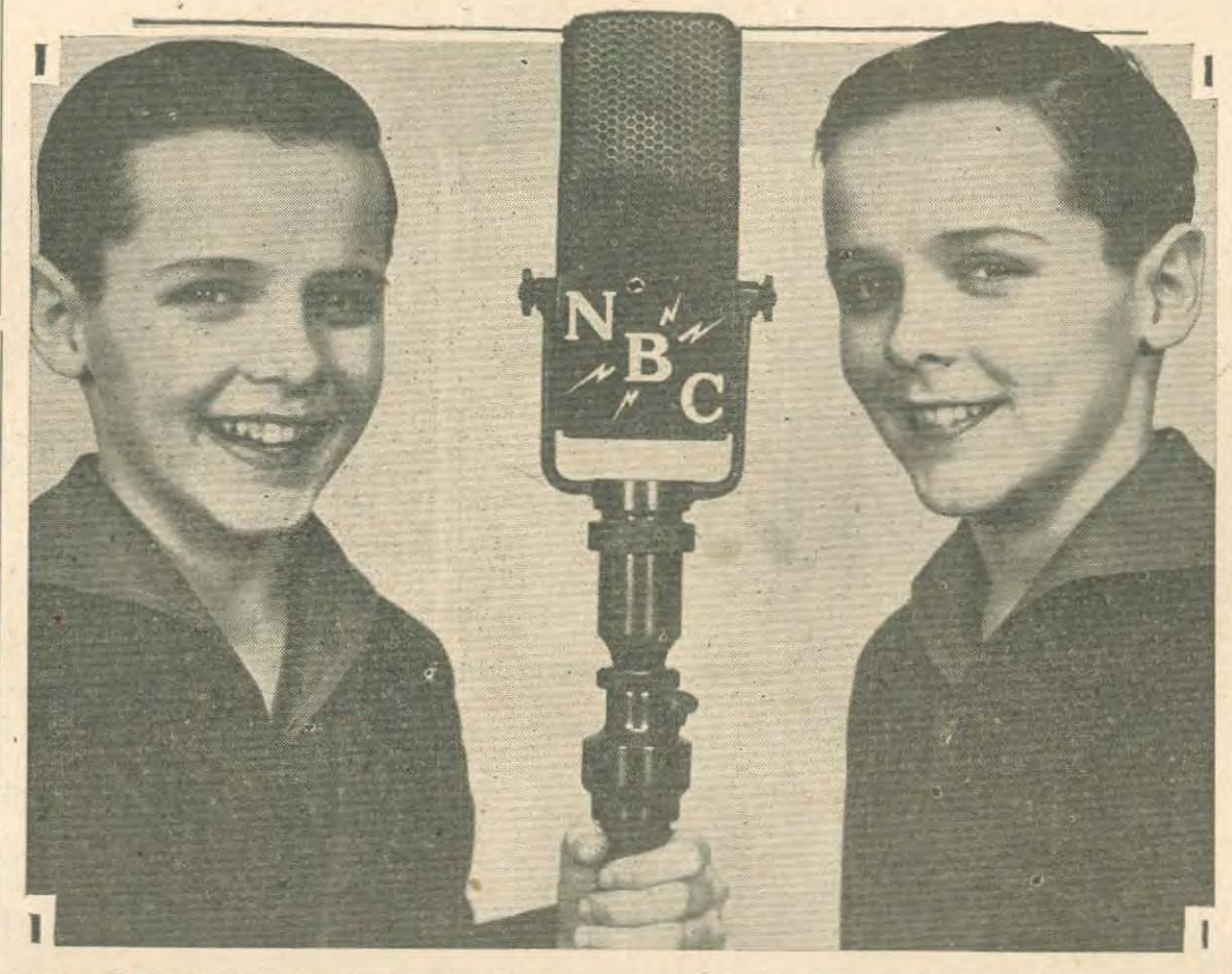
BILLY and BOBBY MAUCH smile, perhaps in anticipation of their Thanksgiving dinner, which is not far off At the left is BILLY-or is it BOBBY? The two are known as the NBC Twins and are heard on half a dozen programs. They are exactly the same height, vary only a half pound in weight and have dark hair and hazel eyes. Before coming to radio they made a reputation on the stage as the Singing and Dancing Twins. Now they sing and play in dramas over the NBC networks.