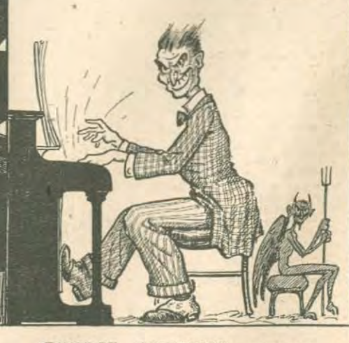
GEORGE GERSHWIN, composer and pianist, looks as though he had just dropped in. He addresses the microphone like an old friend. And when he plays a solo he wears just the shadow of a sly grin, which looks even more wicked when he plays a particularly "blue" passage.