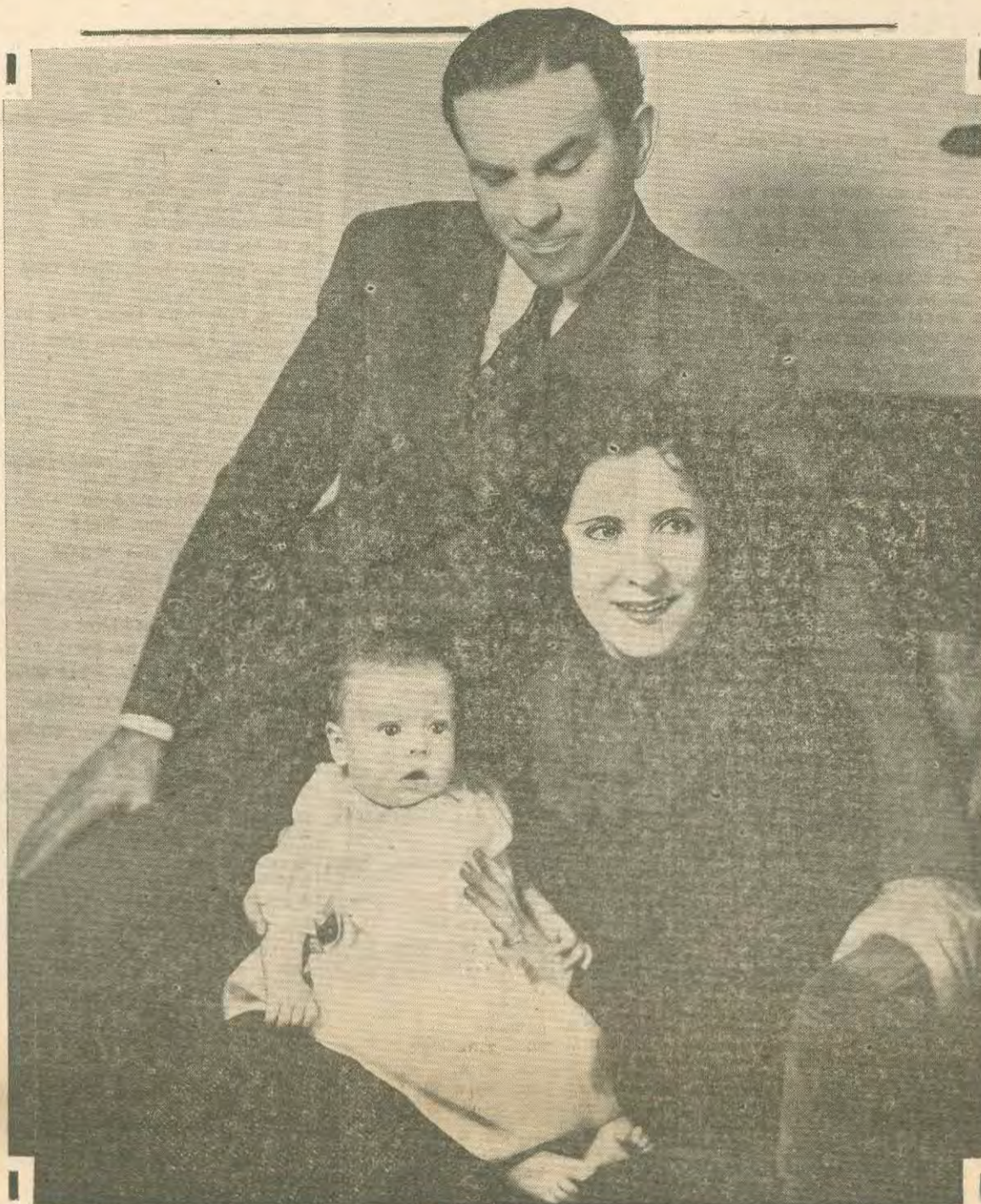
GEORGE BURNS and Mrs. BURNS (GRACIE ALLEN) pose domestically with SANDRA, their new made-to-order daughter, who is the apple of both their eyes, but understood, according to GEORGE, better by GRACIE.