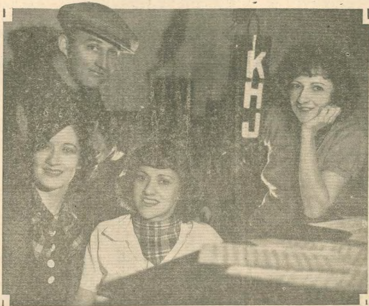
BING (Boo-boo-boo-boom) CROSBY and the BOSWELL Sisters, CONNIE, MARTHA and VET foregather in a CBS studio for one of their first broadcasts. They now are heard each Tuesday at 9 P. M.

considered the best radio act on the air, he answered: Blue, lobster diavolo, and the BOSWELL Sisters.