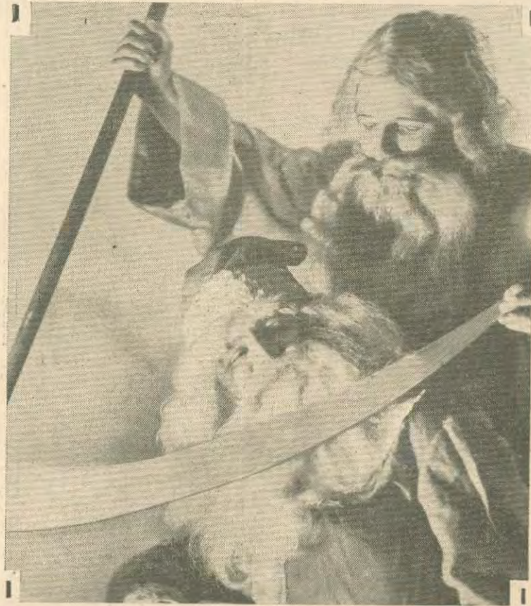
Colonel LEMUEL Q. STOOPNAGLE in the role of KRISUEL Q. KRINGLEAGLE and his partner BUDD as FATHER TIME. They claim that this picture is entirely senseless, having nothing to do with Christmas.

And then, to help father or the hired man wash windows in the basement of the house, SANTAQUEL Q. CLAUSNAGLE has invented a ladder without rungs in it. The added advantage to this, of