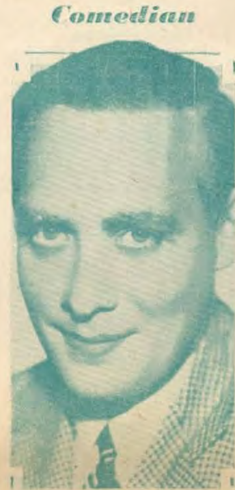
PHIL BAKER, comedian of stage and radio

TIBBETT, CANTOR, BENNY, BURNS and ALLEN, LOMBARDO, WHITEMAN and dozens of others were made by the stage. No matter what field they may use as an outlet for their talents, they always will be stage people