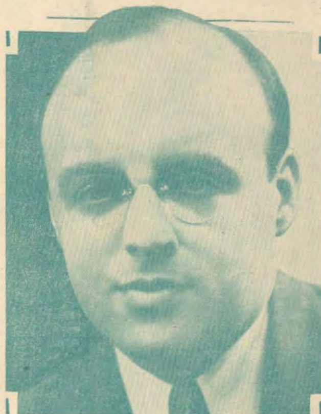
ANDRE KOSTELANETZ, who directs the orchestra in the PONSSELLE, MARTINI and STUECKGOLD concerts, broadcast over the CBS-WABC network on Mondays, Wednesdays and Saturdays from 9 to 9.30 P. M.

He blossomed out as a showman and radio conductor with his first big program "Andre Kostelanetz Presents," during which he started a new trend of blending vocal choruses with special orchestral presentations.