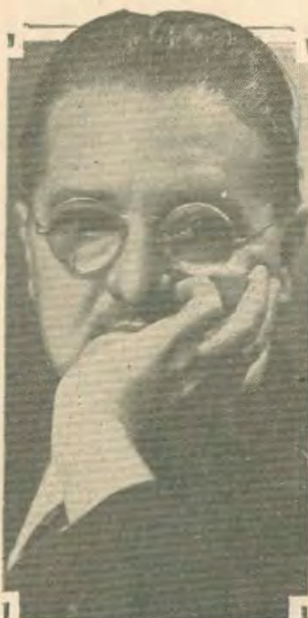
ALEXANDER WOOLLCOTT, author and radio raconteur, has been selected to preside over Columbia's special Christmas Day Show from 2.30 to 5.15 P.M.