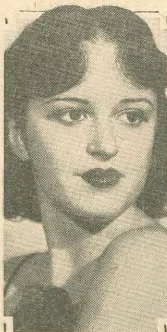
HELEN WARD is one of the liveliest vocalists in the NBC-WEAF three hour "Let's Dance" programs on Saturdays, beginning at 10.30 P. M.