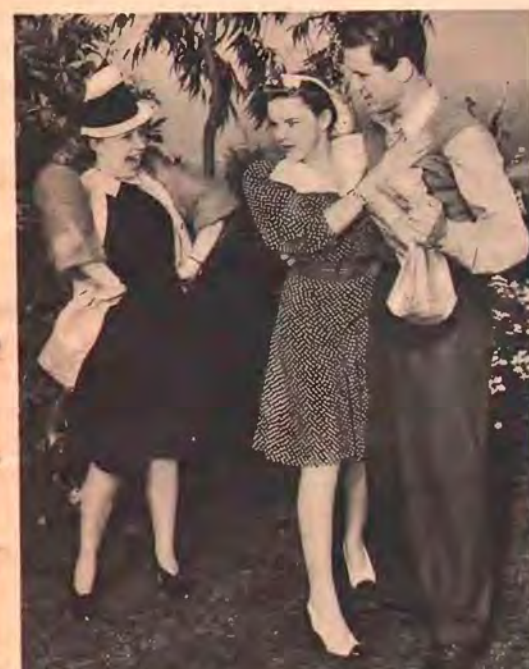
FOR JUDY IN HOLLYWOOD

night owls. They don't go to night-clubs frequently—although the great quantity of pictures printed would make you think differently. Fact is, they're favorites with Hollywood's army of cameramen, who make the most of their few appearances. Both take their work seriously