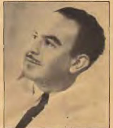
JUAN ARVIZU sings Latin ballads on CBS' South American network

Programs from foreign countries subject to change without notice