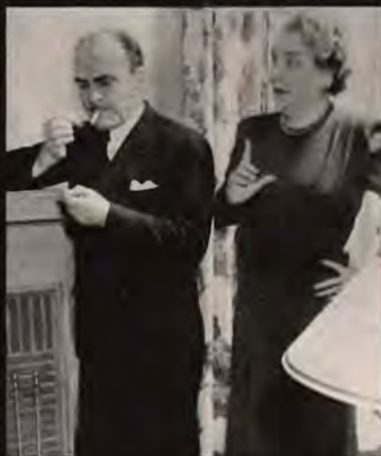
5. SO AUNT EMILY lectures Uncle Jerry, tells him to keep out of Kit's romance. Try as they may, though, the Marshalls find Kit's predicament theirs—and worry