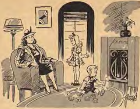
"Junior doesn't speak plainly yet—all that comes out of him so far is static!"