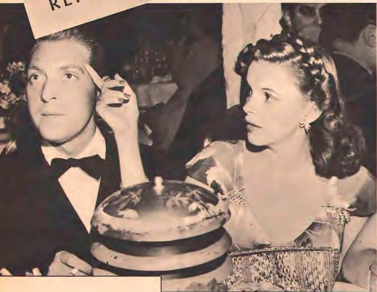
SEAT YOURSELF AT THIS TABLE OPPOSITE