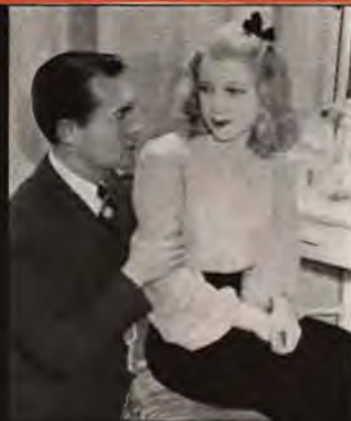
3. PEGGY'S husband was killed when he walked into the idling propellor of Kit's airplane. Kit feels responsible, sorry for her