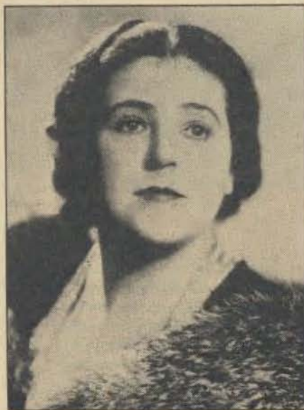
ANOTHER "first" in the career of author, painter, opera star Lotte Lehmann is her new Monday series of song recitals over CBS

Irving Berlin has truly held his finger on the pulse of the people. He sings of their joys, their sorrows, their unimportant moments. He translates their thoughts into singable, simply worded songs, he has had hit after hit. His imitators have been numerous. He has started trends. Irving Berlin is very definitely a composer of the people.