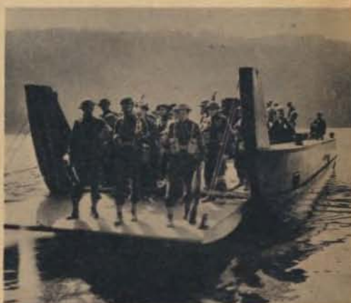
NOT HOLLYWOOD extras but real Commandos in the making are men shown above for scene in film