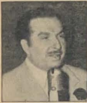
XAVIER CUGAT supplies the Latin rhythms on the Friday night "Comedy Caravan"