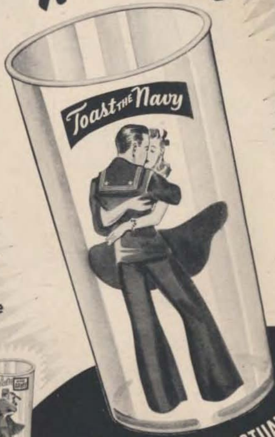
ILLUSTRATION \frac{6}{7} ACTUAL SIZE

No-Nick Chip-Proof Bevel Edge • Full 10 Oz. • Ideal for Beer, Highballs, Water and Every Beverage