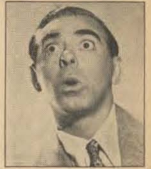
EDDIE CANTOR is the star of the Wednesday night show bearing his name