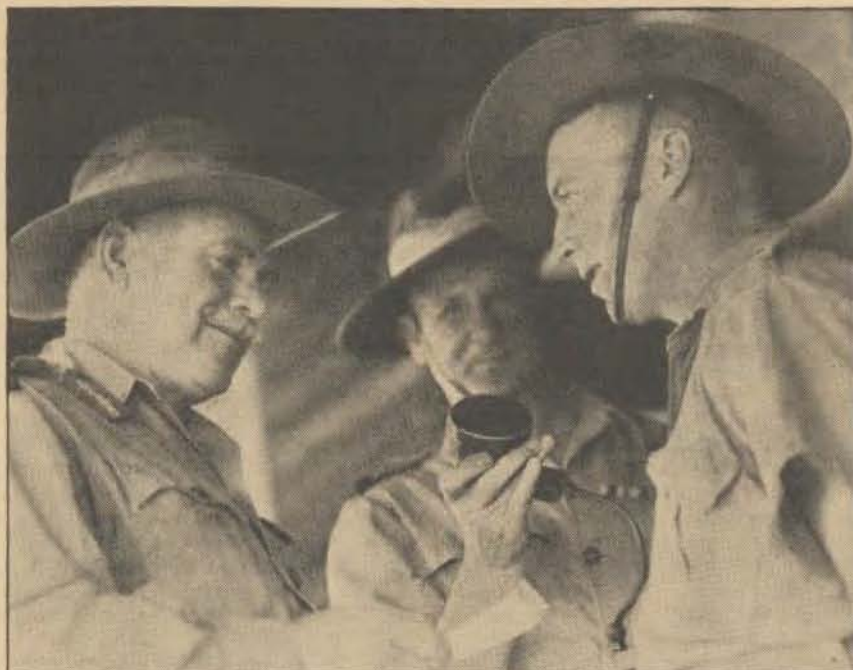
SOMEWHERE IN THE SOUTH PACIFIC General Sir Thomas Blamey (left), popular Commander in Chief of Australian Infantry Forces, chats with a member of the AIF. The conversation is being recorded, possibly for broadcast later over Australia's domestic and foreign short-wave facilities

The number of clandestine, "freedom" and otherwise unlicensed short-wave transmitters in Europe is on the rapid increase (this is to be expected as the day of liberation for the oppressed peoples draws ever closer). One of the more recent to take the air identifies itself as "La France Fidele." Its programs, which are mainly in French or Arabic, may be heard daily from 1:30 to 3:15 and from 5:00 to 6:00 p.m. CWT on 9.575, 7.315 and 7.25 megs. The last named is the best heard of the three frequencies . . . The Roumanian Freedom Station is still operating daily on 11.60 megs, 12:45 to 12:55 p.m. and 3:15 to 3:25 p.m. CWT, in Roumanian . . . "Radio Metropole" (the old Belgrade transmitter) operates from 10:00 to 11:45 a.m. and from 3:40 to 3:58 p.m. on 9.48 megs; from 4:05 to 5:05 p.m. CWT on 6.100 megs. English news is given at 4:15 p.m. CWT . . . Home Service Transmissions of the Budapest short-wave station are currently broadcast from about 2:30 to 5:55 p.m. CWT over HAT2 (6.66). News in English is given at 4:25 p.m. CWT.