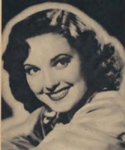
Linda Darnell , glamorous 20th Century-Fox star in "Loves of Edgar Allen Poe," uses GLOVER'S to condition scalp and hair.

MANY of Hollywood's most beautiful and glamorous stars keep their hair charming and refreshed with GLOVER'S famous MEDICINAL treatment, so popular with millions of men and women! GLOVER'S is a medicinal application recommended with massage, for Dandruff, Itchy Scalp and excessive Falling Hair. TRY it today—you'll feel the exhilarating effect, instantly! Ask for GLOVER'S at any Drug Store.