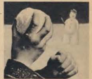
Watch children smile with relief when soothing Noxzema is applied to tender, chapped skin.