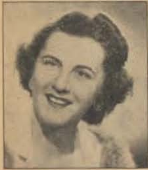
ANNE SEYMOUR plays the pioneer woman Prudence Dane in "A Woman of America"