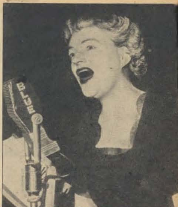
LARGEST AUDIENCE ever to attend "Screen Guild Players" saw adaptation of "Holiday Inn," starring Bing Crosby and Dinah Shore (left). Morton Downey (above) returns to radio in a five-a-week Blue Network show