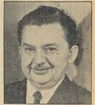
JEAN HERSHOLT plays the title role in the "Dr. Christian Stories"