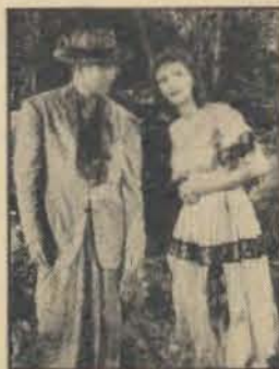
Two stars in "Happy Go Lucky"—Mary Martin, Rudy Vallee

Verdict: Fine tonic for hectic war days.