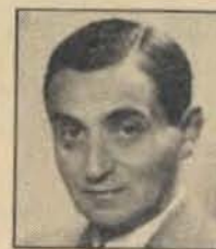
Irving Berlin: His successes second to none

A MERICA has had several eminent representatives of people's composers, but surely none have been closer to the people or more of the people than Irving Berlin. Berlin may have had ambitions to write important music somewhere along the path of