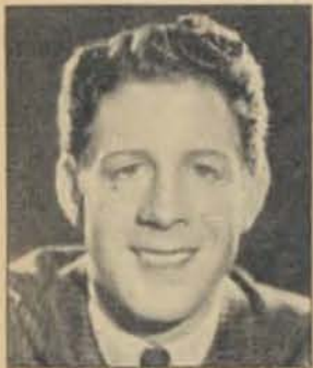
RUDY VALLEE of the U. S. Coast Guard still conducts the "Rudy Vallee Variety Show"