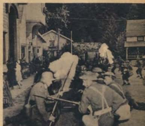
CANADA'S Commandos (above) go through actual tactics they employed later in overseas combat