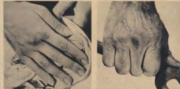
Housework often causes red, chapped hands. Help protect and heal them with Noxzema.