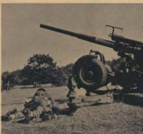
ANTI-AIRCRAFT was used and, between sub-hunting patrol duty, a warship of the Canadian Navy!