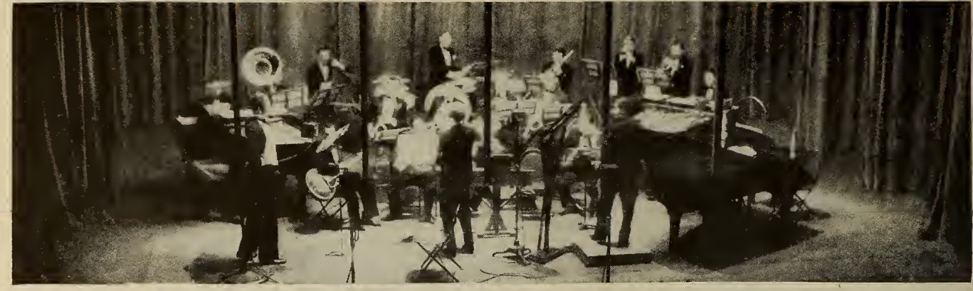
Fig. I. Above you see Rudy Vallee in the act of singing. Note the balance solidly on his left foot while his right is poised on toe ready to shove off for a high note.