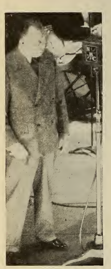
Fig. II. Moran of Moran and Mack, "The Two Black Crows" spreads his feet out firmly and takes a slightly crouching position. He feels belligerent. Dares such discussions as the early bird and the worm.