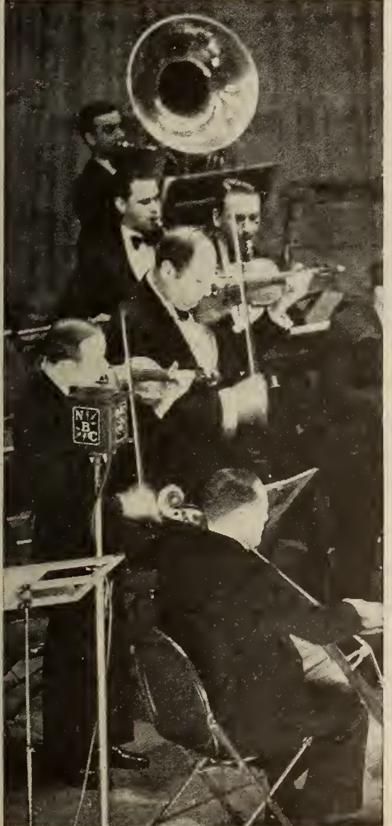
Fig. VI. Musicians at rising tempo, some of them unable to stand. The fiddler nearest the mike, however, keeps his left boot in tapping position to keep time in case the baton slips a half-beat or two.

You never hear Rubinoff say a word in reply to Cantor's jibes. It's because Eddie talks behind his back, and Eddie's voice is only little more than a whisper when poised before the mike.