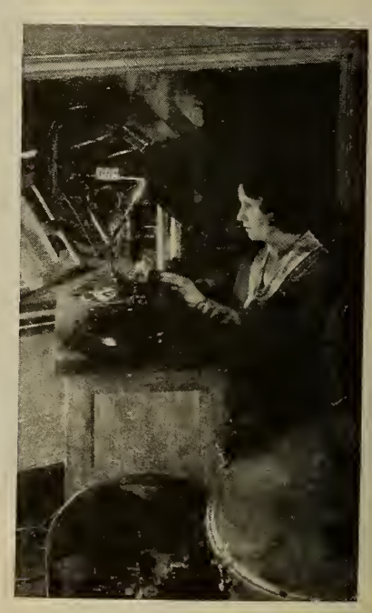
Scene in the studio

Visions of the world of the future have held an enthralling interest from time immemorial. They have formed the subject matter of literature, stage productions and motion pictures. This program, however, marks the first time that an attempt has been made to picture such a world for the radio audience.