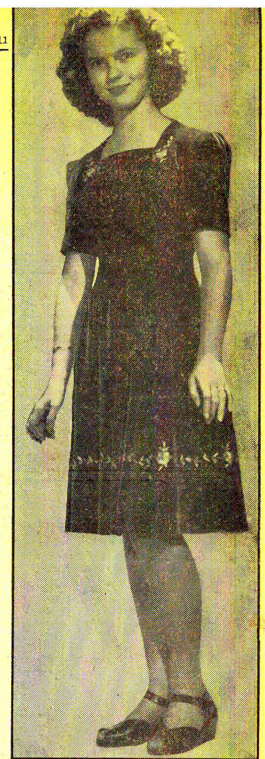
While she's neither tigerish nor svelte, nor sleek, robust, or undulant, she's poised, she's streamlined, and for the first time in her seven-year career, the star of a radio show all her very own.

What she does on "Shirley Temple Time" will have to be done with professional skill. No longer a "baby star," she's competing with the best in the business. Her dance steps must offer at least a fair comparison to