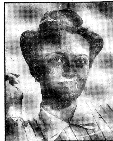
Academy Award winner, Bette Davis, displays her dramatic fireworks Sunday on Screen Guild's presentation of "Stage Door." See Pre-Cast page 7.