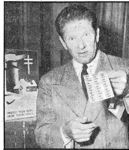
Stumping for the annual Christmas seal drive with true "Arkansas Traveler" zeal and ardor is Bob Burns, one of radiodom's nicest people.