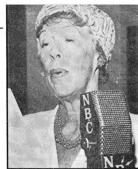
In another episode of "Ma Oliver's Boarding House", tart-talking Edna May guests on Rudy Vallee's show this week. See Pre-Cast this page.