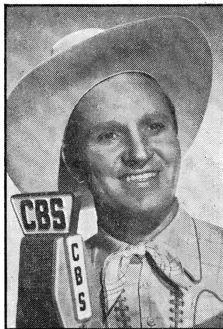
Gene Autry the man. Gene Autry the town proved it knew a thing or two. (See Terrific Day.)