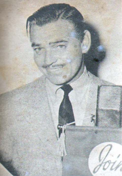
CLARK GABLE , again in civvies, makes a series of radio transcriptions which are being used this month throughout the country in March of Dimes campaign.