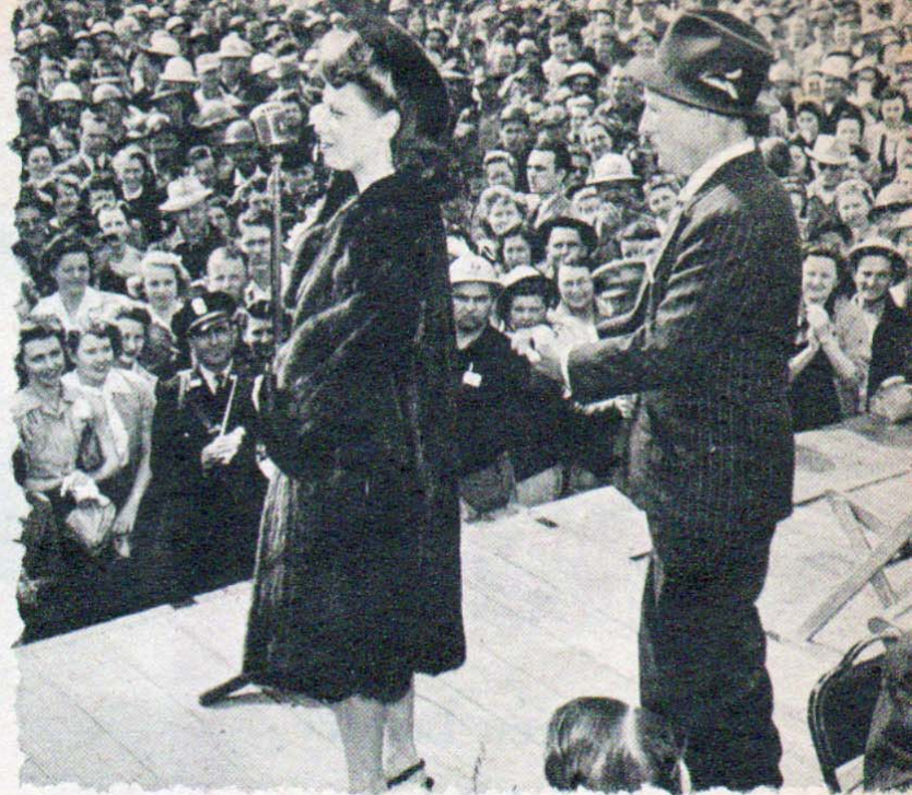
▲ SINGING TWOSOME make an applauded appearance at Richmond Shipyard No. 3 of Kaiser Company. (Note Der Bingle's staid attire—unusual).

for the first time in 1940 with the Eddie Cantor program, she had just one ambition: to meet Bing. But she couldn't quite get the nerve to go up and introduce herself. She slipped into the studio where Bing was rehearsing and sat far back in a corner alone.