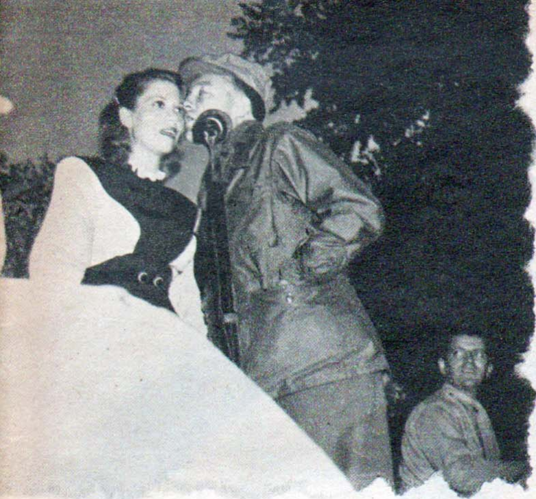
▲ LAST YEAR , Dinah and Bing were mentioned by General Eisenhower as two stars his men most wanted to see. Result shown above: Groaner and Dinah giving a show for engineers overseas.