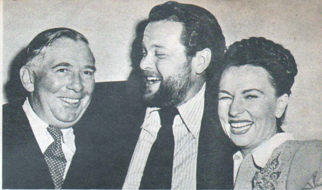
▲ CO-WORKERS FROM THE OLD DAYS of the "Mercury Theater," Orson, Ray Collins and Agnes Moorehead shared laughs during rehearsals of "The Master of Ballantrae," a recent "This Is My Best" production that reunited the gifted trio at the microphone. Of Welles, Collins told us, "He is always reading. He is a great man for books."

Tuesday found us on deck, and Mr. Welles on-stage in CBS' Studio A, directing, narrating and portraying the title role in Robert Louis Stevenson's "The Master of Ballantrae." We were happy to see that he had with him his cigar. He kept it clenched in his hand, puffed on it spasmodically all