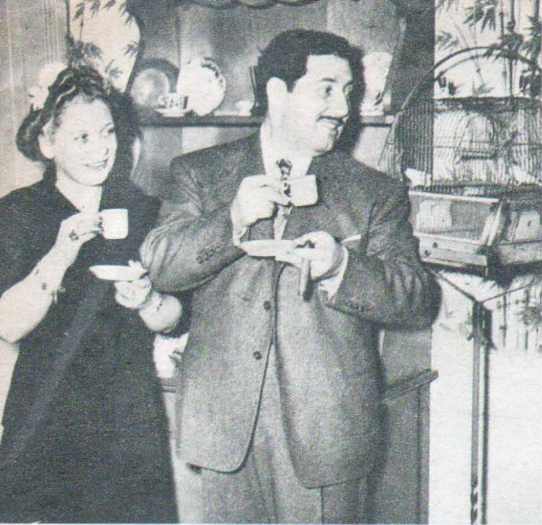
▲ THE COLORFUL DINING ROOM is the home of "Throcky," Betty's bright yellow canary. "Ginger," a black spaniel, and "Throcky" are the household pets.