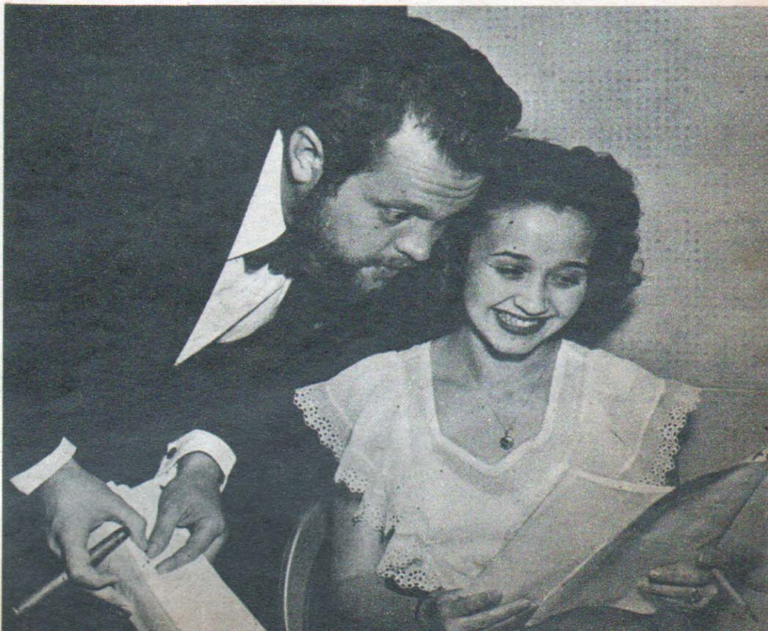
▼ WELLES IS GENTLE, PATIENT, ADMIRING of gifted youngsters such as Jane Powell (below) who appeared with him in "Snow White and the Seven Dwarfs." (Note Orson's cigar, his most constant companion. During rehearsals, he gulps down several glasses of iced tea.)