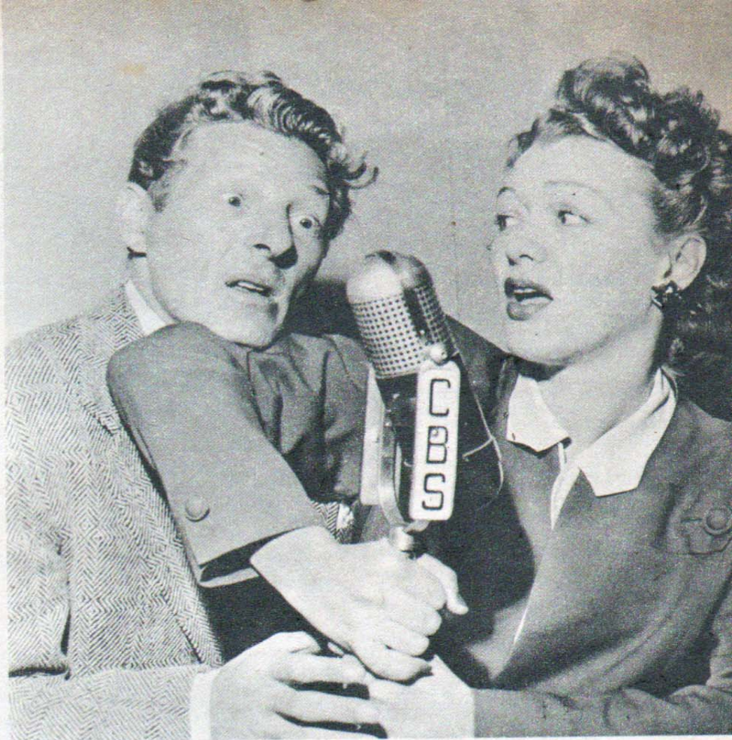
EVE AND COMEDIAN DANNY KAYE have a lot of fun kidding one another on the present CBS Kaye show. The two have been friends since their New York version of "Up In Arms" several years ago.