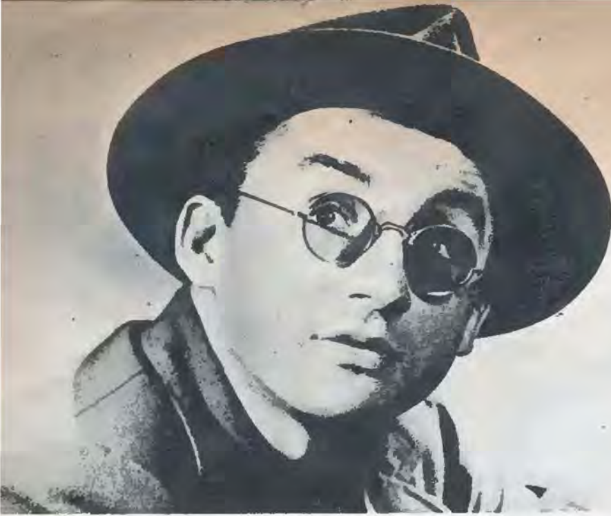
▲ A NEW PORTRAIT SHOWS THE 'SAME OLD OBOLER' in the get-up of which he is so fond; casual coat, T-shirt, pork-pie hat atop his head and comfortable shoes. Back on Mutual he is presenting dramas that entertain and inspire.