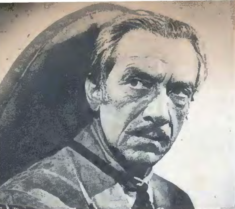
THE PROGRAM'S NARRATOR is famed actor, Pedro de Cordoba.