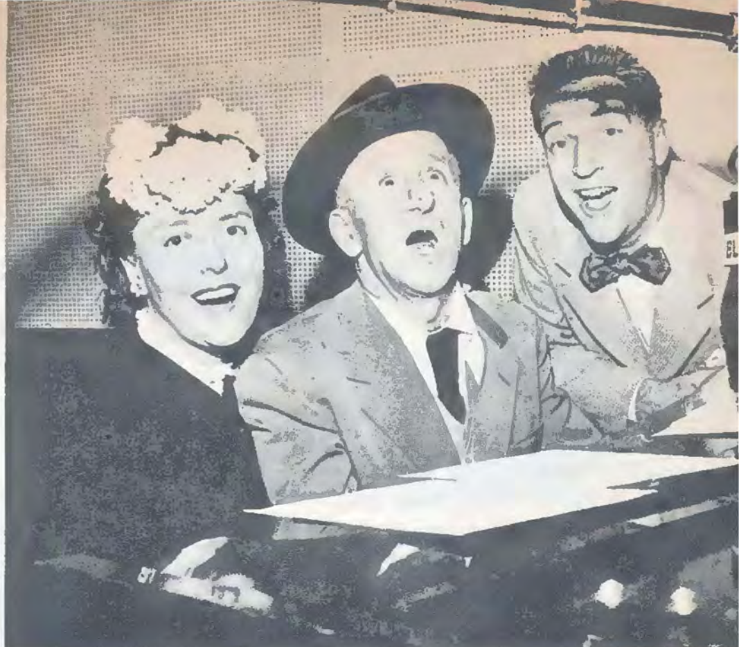
▲ A LOT OF HIGH notes were reached the night Jimmy Durante and Garry Moore paid Evelyn's ABC Network show a visit. Too bad the Durante-Moore-Bigsby antics weren't recorded for television.

But not the editor of Radio Life Magazine. No sir! Despite the fact that the presses, each week, roll out this magazine with all the punch and precision symbolic of such com-