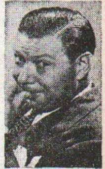
Harry Von Zell

The comic emcee of "Wednesday With You," HARRY VON ZELL, got his big break in radio because he could laugh. And take it from us, only the worst kind of grouch could listen to Harry's contagious giggle without relaxing to enjoy the fun. This talent has been exploited to its fullest with Eddy Cantor, but Von Zell has also appeared on such important air programs as: Fred Allen, Stoopnagle & Bud, Phil Baker, The Aldrich Family, Dinah Shore and many more. Born July 11, 1906 in Indianapolis, Harry spent a boyhood divided between fishing and accompanying his father to major sports events. The elder Von Zell was a sports reporter for the Indianapolis Star. Harry's university training was at S.C. and one of his early radio jobs was with KMTR where he held down various positions ranging from announcer to writer-producer. In 1929, Paul Whiteman launched his first air series and Harry won the announcing job in competition with 250 mikemen. This was the "open sesame" for Von Zell which has lead to fame and fortune. His greatest hobby is sailing and nothing gives him more pleasure than old clothes, fishing tackle and boats. Remember the time of Harry's current appearance on KFI — 6:00 p. m. Wednesdays.