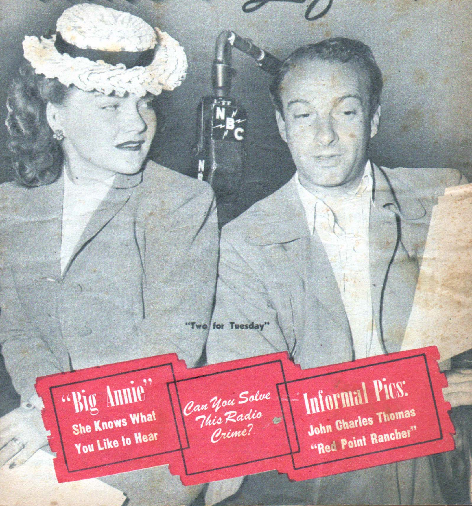
"Two for Tuesday"