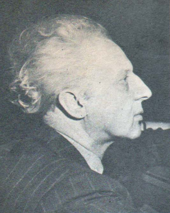
↑ TO PRESENT WINNING VOCALIST. music director of the Hollywood Bowl, Leopold Stokowski, directs the Bowl Symphony when the Audition winner appears as soloist in the Bowl on August 26.

A T BEST the road to success in the concert field is a stony one. Any artist who has won acclaim is the first to warn the neophyte that toil, sweat, and tears are the price of fame.