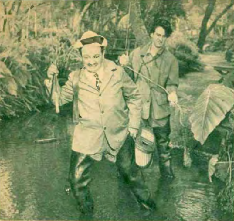
ON THE BANK, BENT ON SNARING a mess of fish, are Mel Blanc, CBS comic, and Hans Conried, who plays "Mr. Cushing", High Chief Potentate of the Loyal Order of Benevolent Zebras on Mel's show.