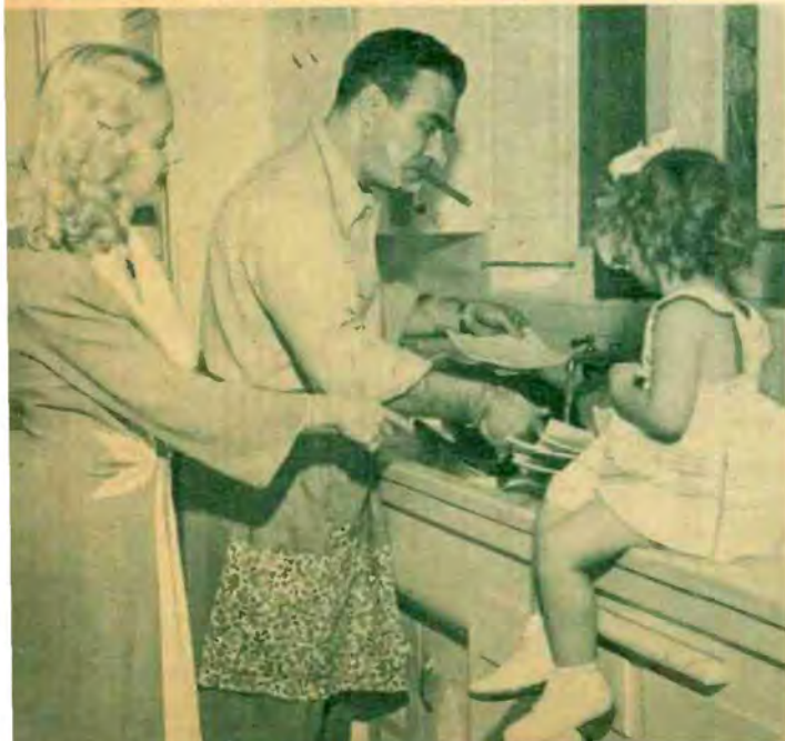
↓ THE SOAP GOES THERE, not on your face! "Mother" got home in time to find Bill stuck with cleaning up in the wake of a tea party that was a "must" after a nap.