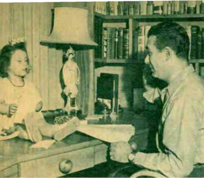
↑ "HO HUM! I'VE GOT YOUR NEWEST hit tune torn to bits now, so I guess I'm ready for my nap." (Bill's expression indicates he's not too sorry.)