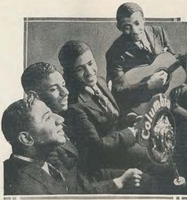
THE MILLS BROTHERS

Sitting pretty, indeed, are the Mills Brothers, who, in less than a month last year vaulted into the front rank of radio's elect with their ingenious counterfeiting of wind and percussion instruments. Left to right are Herbert (saxophone), Donald (hot licks), Harvey (trumpet) and John (tuba). Broadcasts by the quartet over WNAC and the Columbia network each Monday and Thursday at 9:15 P. M., are picked up these days from various cities through which the Mills Brothers pass during their vaudeville tour.