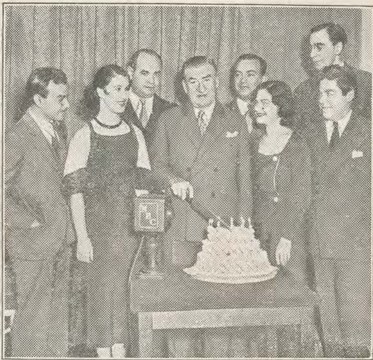
MAJOR BOWES CUTS CAKE AT 10TH BIRTHDAY CELEBRATION

The Capitol Theatre Family, heard over an NBC-WTAG network each Sunday morning at 11:30 a. m. has just completed its tenth year on the air.