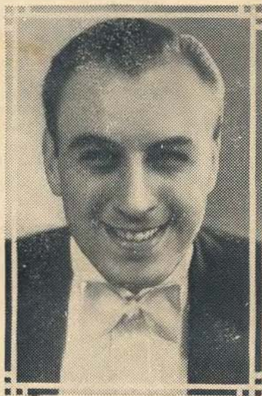
★ RUSS COLUMBO ★ ★