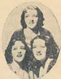
The Boswell Sisters.