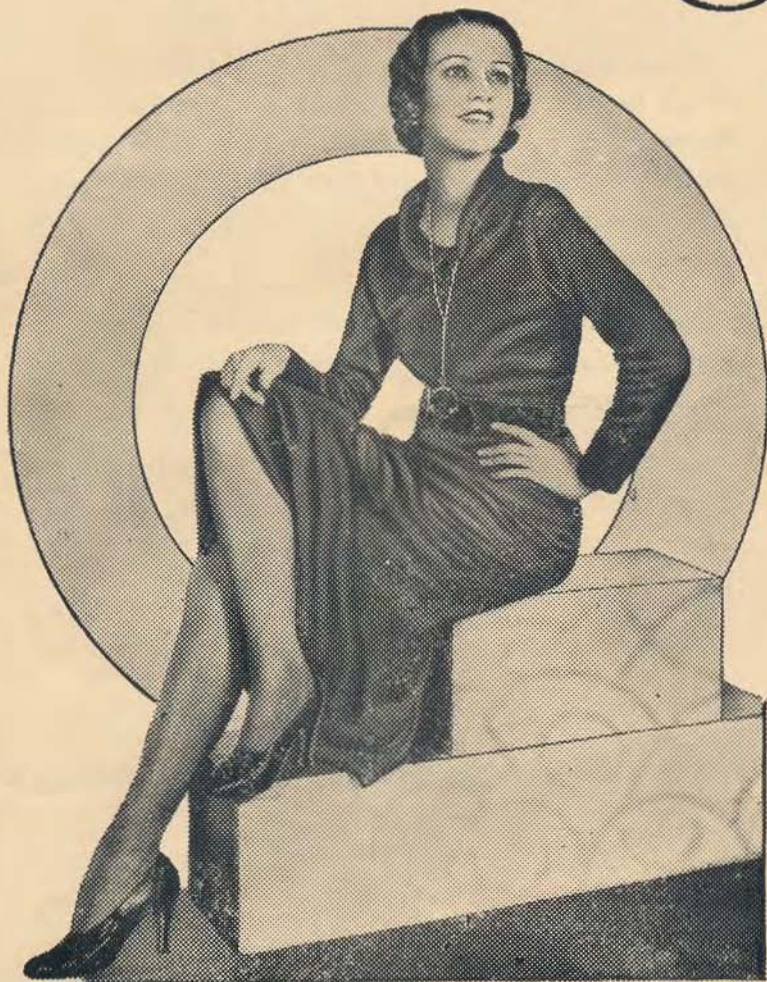
JANE FROMAN (Story on Page 31)