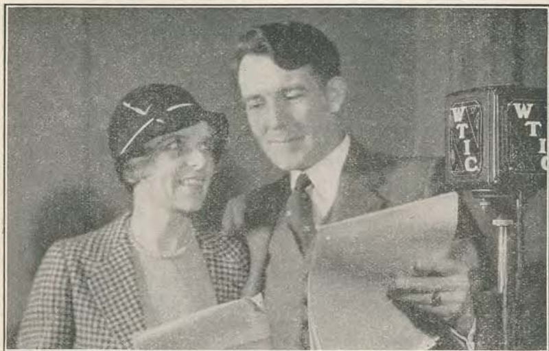
BLANCHE SWEET AND GUY HEDLUND

Old-time movie lovers' hearts fluttered with pleasant memories due to a recent broadcast from Station WTIC of Hartford. The reason—or reasons—are shown in this picture.