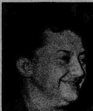
Jean Hersholt —"Dr. Christian" drama