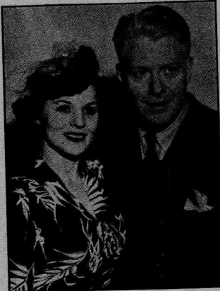
NADINE CONNER, Metropolitan soprano, has joined Nelson Eddy in his new commercial musical show on CBS Wednesdays. It is reported Eddy will turn his whole salary for series over to war work

Those fires weren't extinguished for two days, and it wasn't until after that that the hysterical Japs pulled