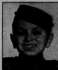
"Johnny Presents"—university salute