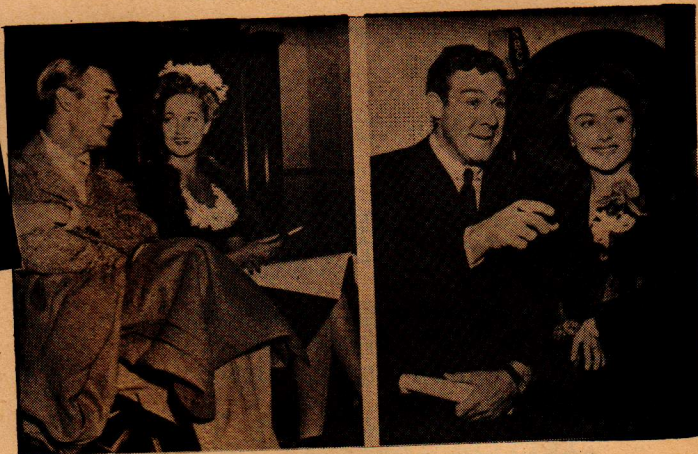
DOROTHY LAMOUR was "commanded" to appear on a broadcast by service men, but she was escorted to the studios (above, left) by film actor Randolph Scott. Above, right, Paul Douglas acted as master of ceremonies of several shows, took along his lovely bride, actress Virginia Field

traditional Bronx "bird" for New Yorkers who might be homesick for it, and especially for Herr Hitler, in case he might have been listening! A sergeant in North Ireland wanted to hear his dog bark. Queenie was brought to the mike and barked her greetings to her master at the behest of Kate Smith. Important link in the production of these shows is the Hollywood Victory Committee, which presents letters from the service men to the stars, delivers hard-to-get names, including some who never before have appeared before a microphone. The first series of the shows originated in New York, now come from Hollywood. It is released on eleven short-wave outlets, seventeen different beams. Although times of broadcast are in general carefully chosen to suit the listening convenience of the variously located armed forces, here is a partial working schedule for "Command Performance" broadcasts: Sunday, 11:30 a.m. EWT—WCBX and WCRC (beamed toward Europe); Sunday, 9:15 p.m. EWT—WCBX, WCRC and WCDA (beamed toward Canal Zone, West Indies, points south); Sunday, 10:00 a.m. EWT—WRCA, WNBI and WBOS.