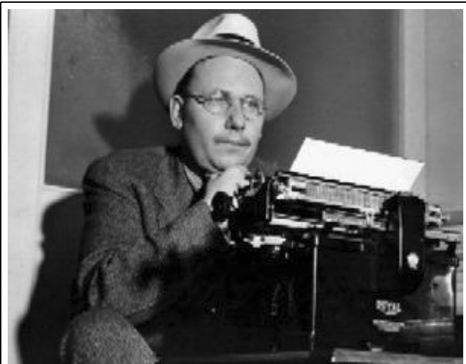
Carlton E. Morse

and soon was hired at NBC Blue Network outlet, KGO. His first assignment was scripting a program titled, "House of Myths." He also created plots for programs based on San Francisco Police files, a prelude to his later hit series, "I Love a Mystery," rivaling the popularity of "One Man's Family."