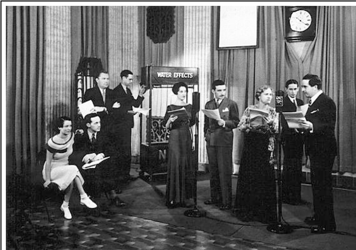
The cast performing an episode of “One Man’s Family”

And, make no mistake. “One Man’s Family (OMF) was NOT a “soap opera” despite that common misperception by some reviewers and critics of the Peabody Award-winning series. No Helen Trent “forever aged just over 35 and “dashed