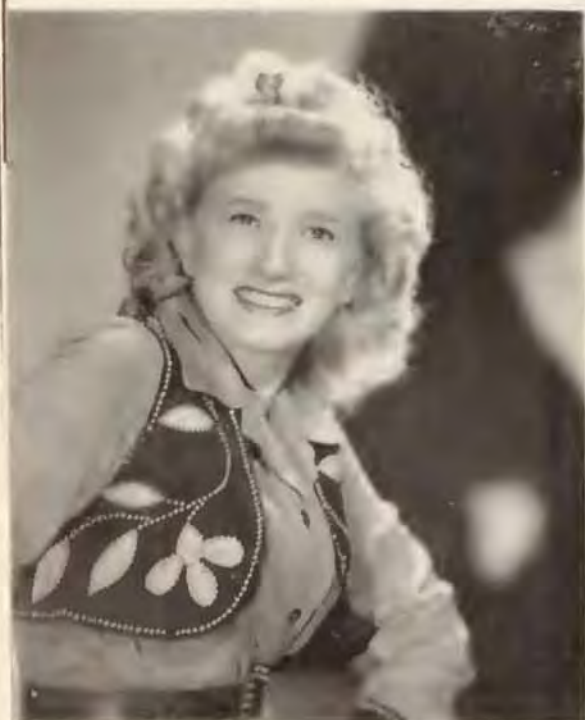
Block on WNEW transcribed, on KFVB alive