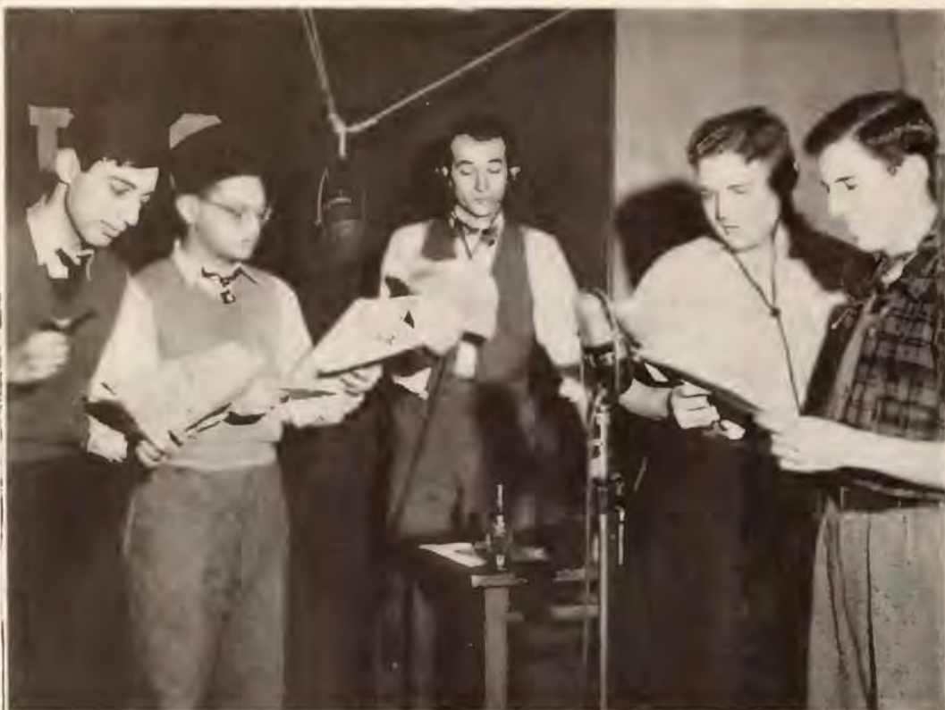
There's nothing more serious than the undergraduates themselves building a program for their own fleapower broadcasting station. These boys are really working on their program

a factor that contributes to or detracts from a station's audience.