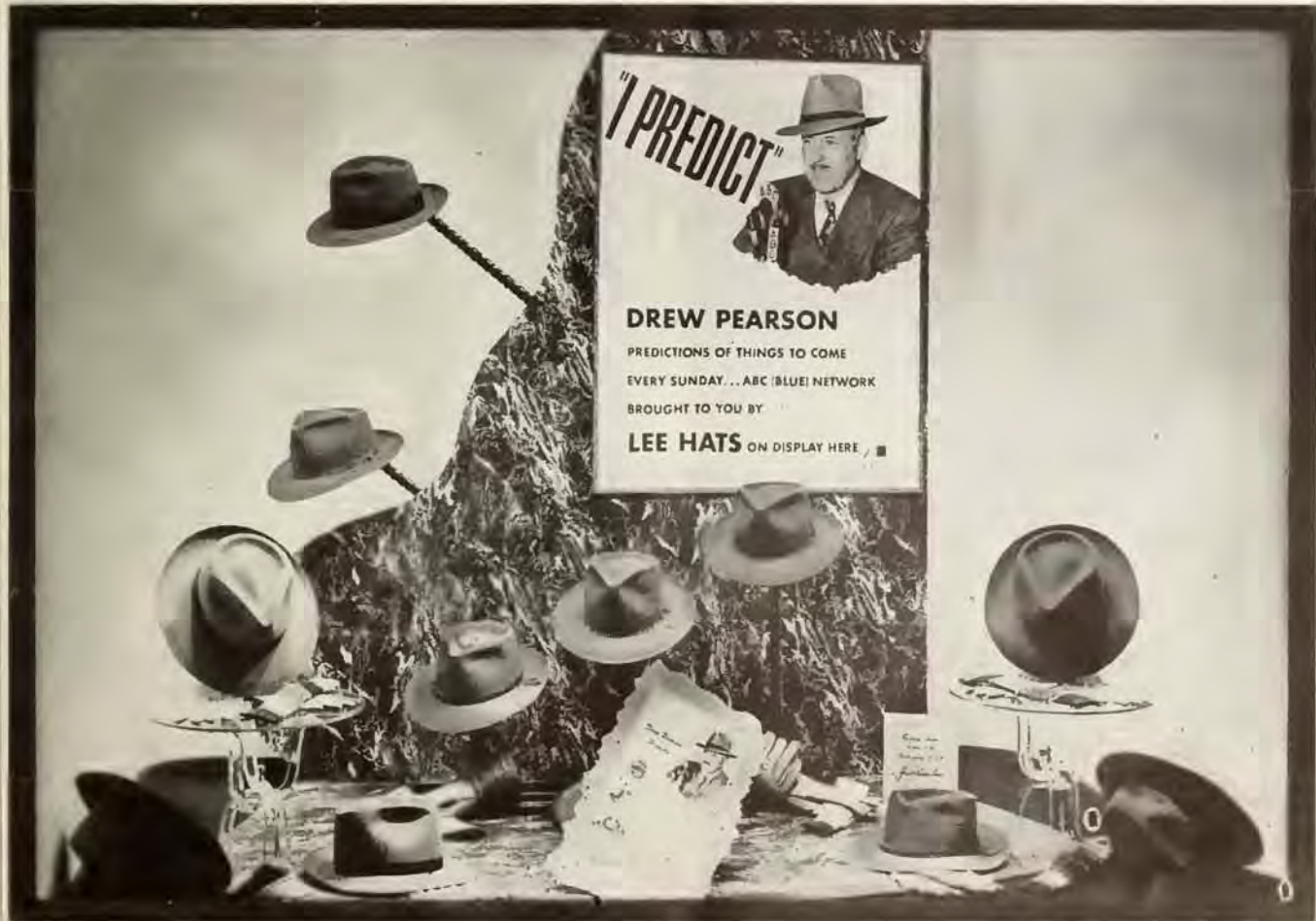
In 3 months over 1,000 window displays tied Lee Hats and their air program together at the point-of-sale. Retailers discovered that