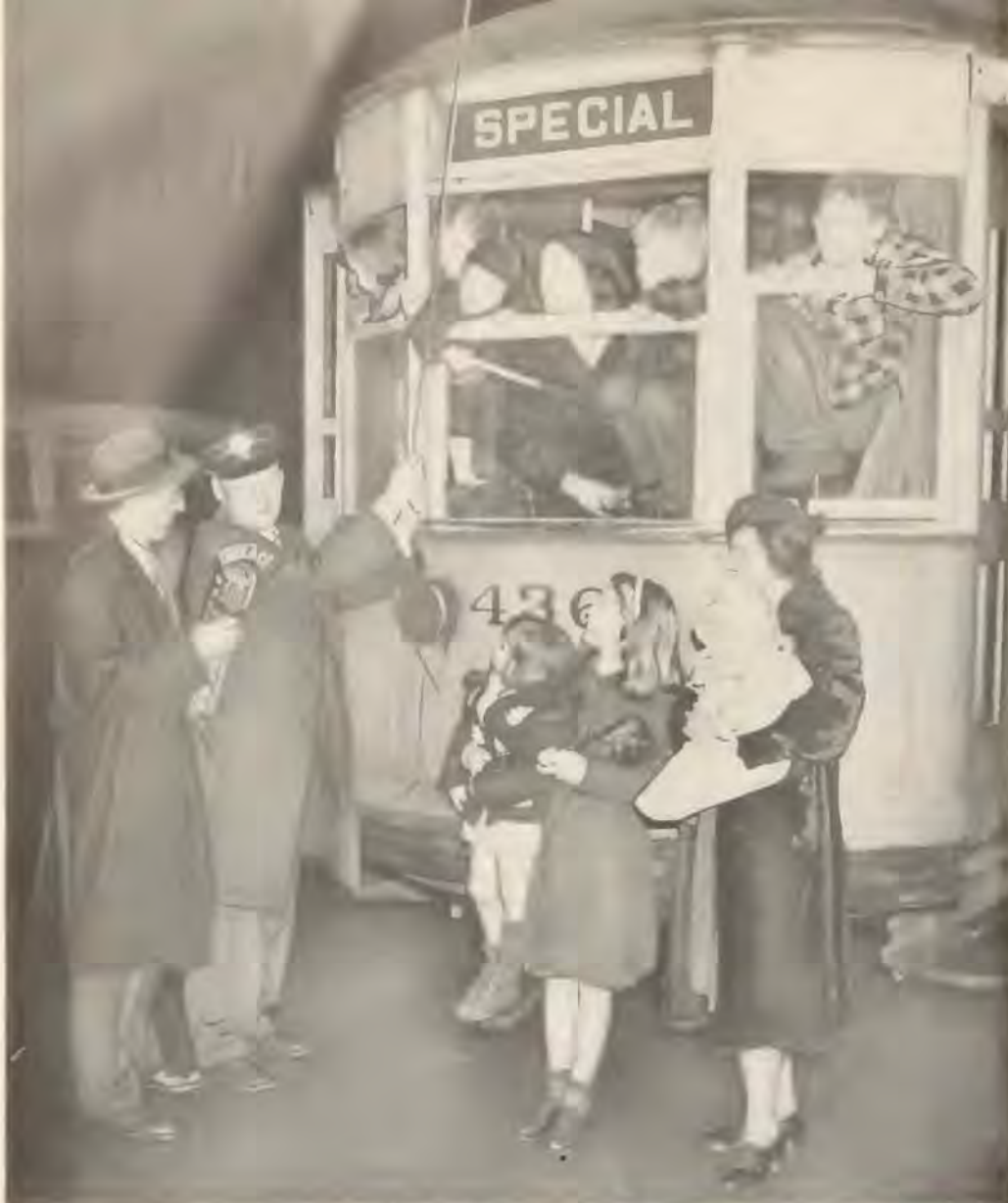
Two full-size trolley cars were given away in a resultless "Who Was Kilroy?" contest

Although tie-in advertising was bought by ATA members, "Spotlight" gained no listeners