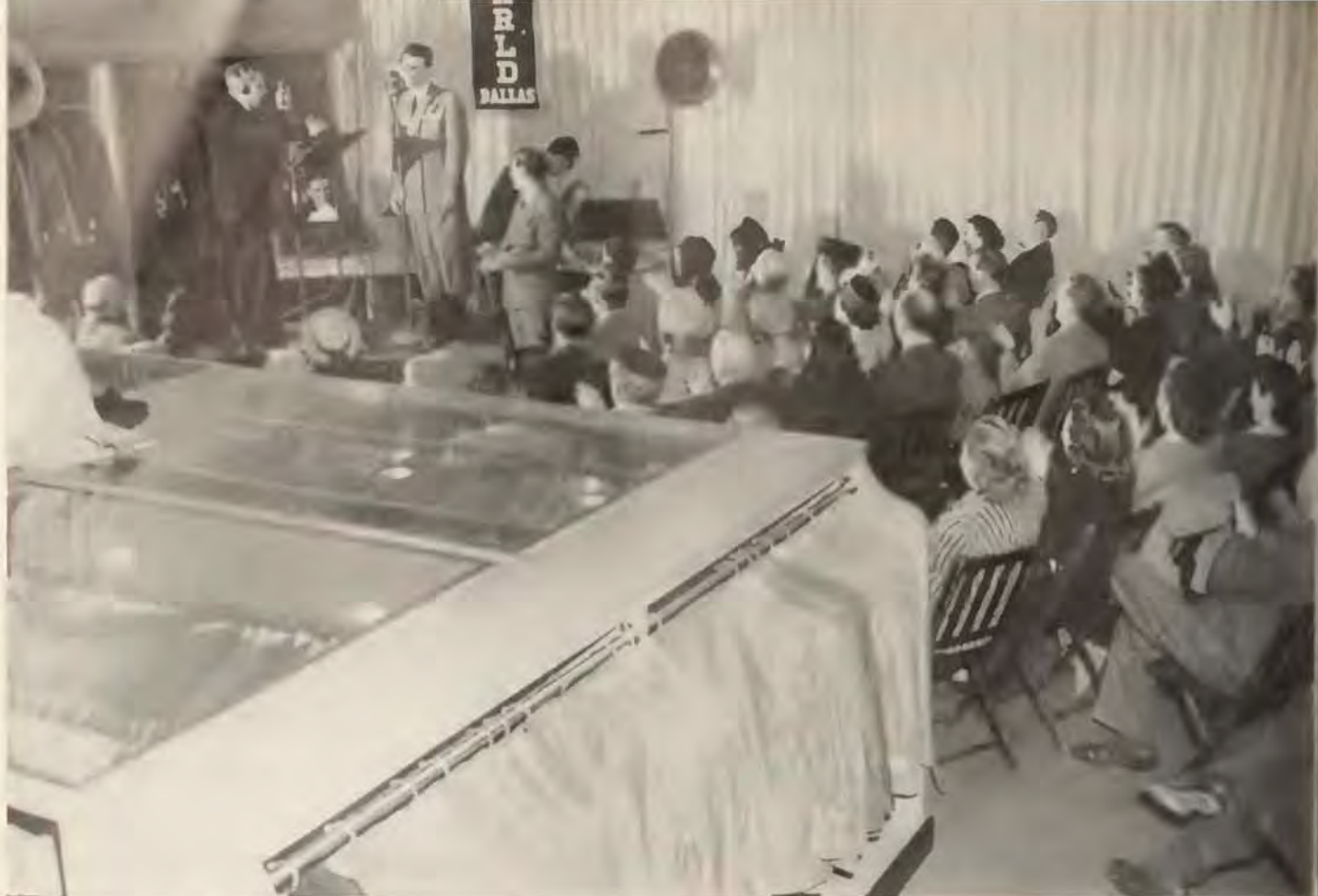
When Hart, Schaffner & Marx salesmen meet Hart, Schaffner & Marx salesmen, "Quiz of Two Cities" naturally broadcasts from a clothing store

which rank one, two, three in the order named, went overseas in great quantities. Listerine stayed at home and was out-of-stock far less than its top competition, and became number two in sales. Demand overseas was for the three leaders in popularity. Listerine is doing better than it did pre-war and it expects to do better, via the Quiz and its spot operations.