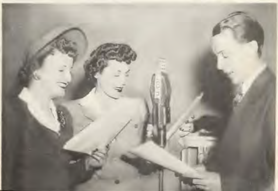
"Belcher's Children" reached housewives and celebrated their 10 year Wonder Breeding (Ten year booklet above right)