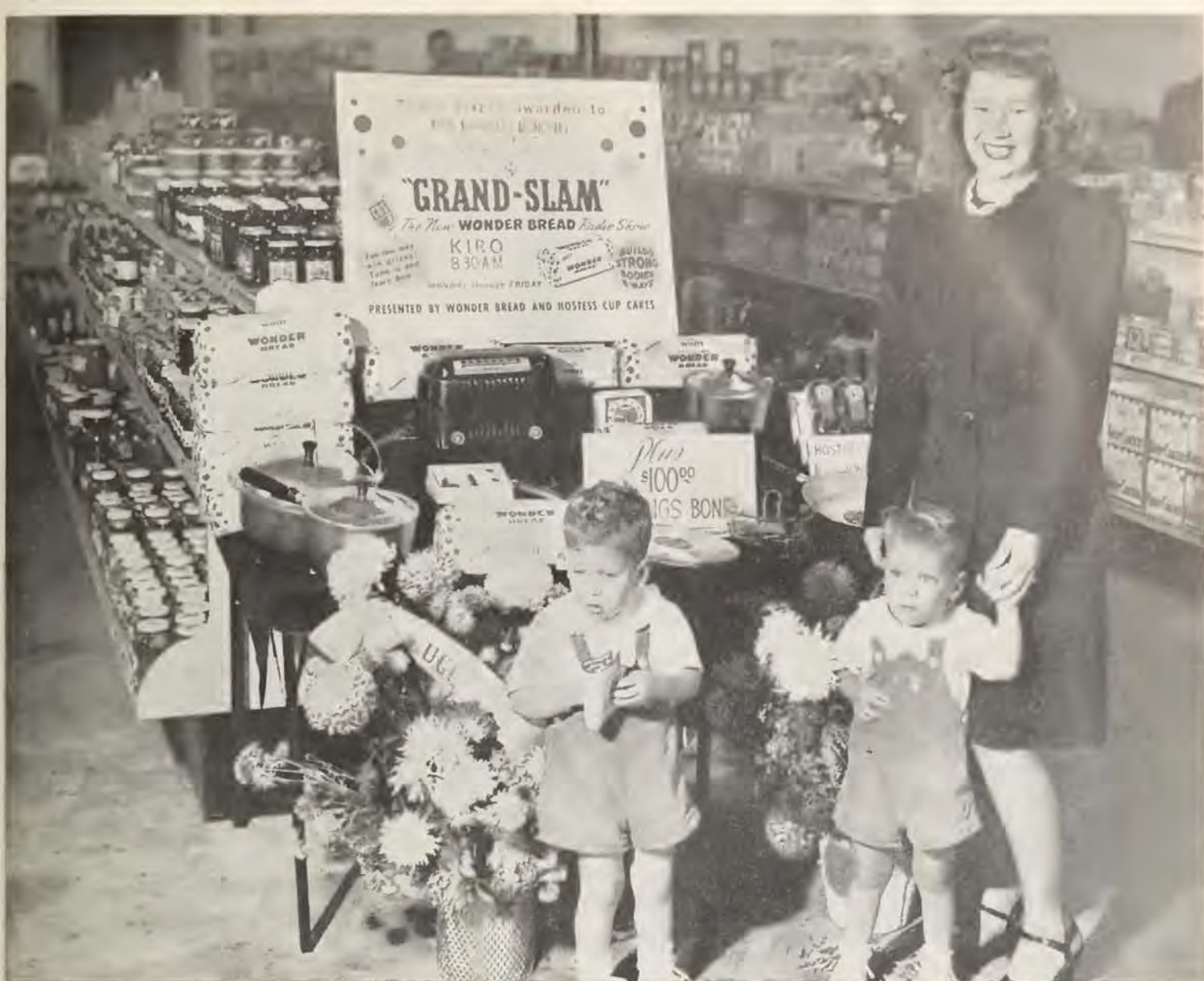
When a listener makes a grand slam and wins the works she usually permits exhibition of all her awards at her local grocer's—and poses too