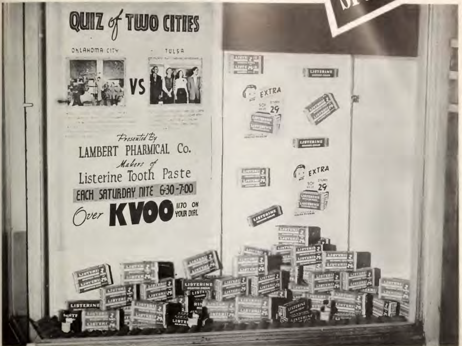
Drug stores play up inter-city spirit of competition by featuring the broadcast in their window displays of Listerine Tooth Paste special