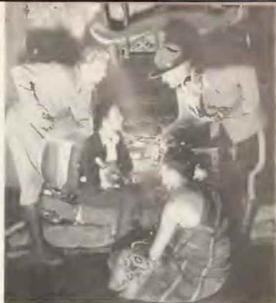
"Renfrew" had a high juvenile audience but Continental found youngsters don't buy bread

the air was continuing all during this period (from 1926 on). After some hit-or-miss testing, B.B.D. & O. finally came up