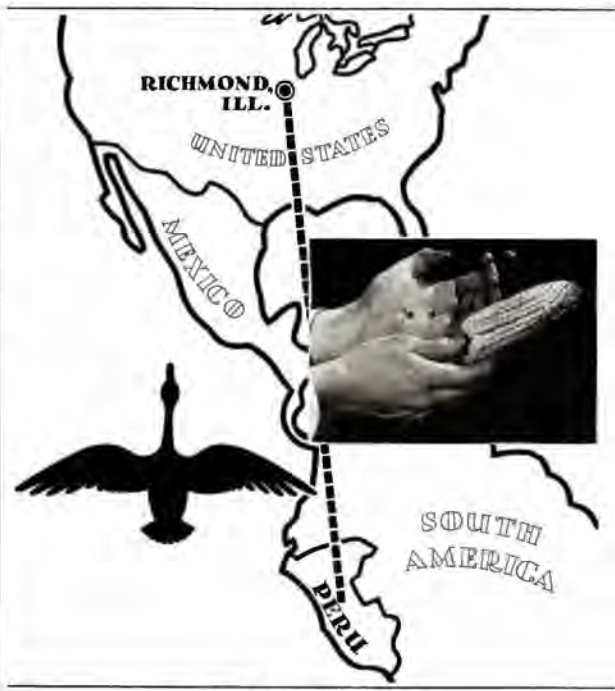
Route of the Old Gray Goose