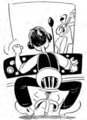
"Home on the range, huh? . . . I wish he was there now."