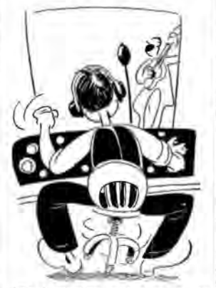
"That opening will have to be screened this summer."