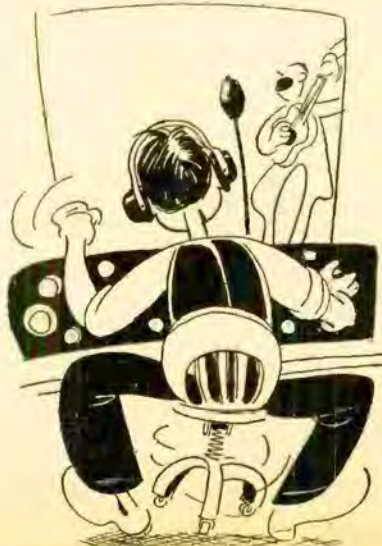
"They say his mother enjoys it."