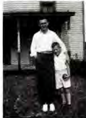
Ramblin' Red Foley at home in Berea with a friend.