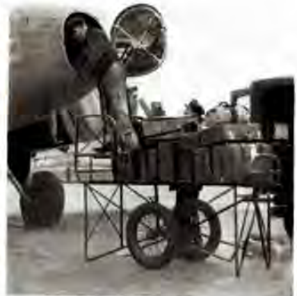
Above, bags go aboard; at the left, loading on Uncle Sam's mail; below, left, the Municipal Airport's observation and radio tower; below, the port's "stop-go" lights for planes.