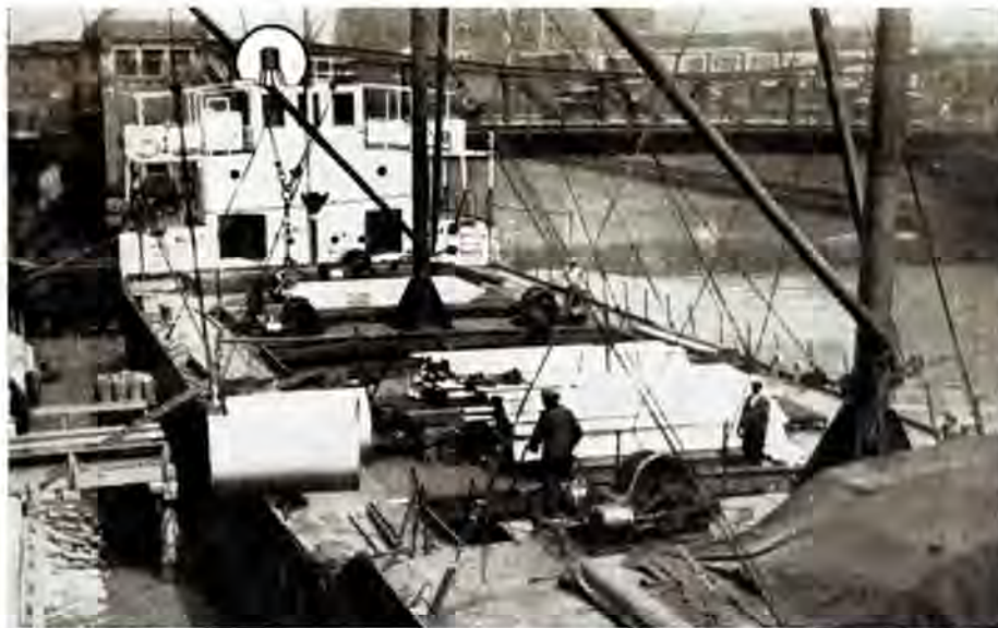
The deck of the steam freighter Mondoc unloading news print. Outlined in the circle is the tank enclosing the radio equipment.

Time for us to be closing the page, friends, so until a week from today, when we can all sit down for another chat about our mutual friends and go over things in radio, we'll say just good-bay. See you next Saturday.