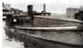
A view of the Dad Ludwig.