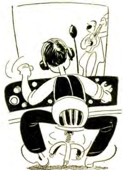
"He's entering the Clay County Fair hog-calling contest."