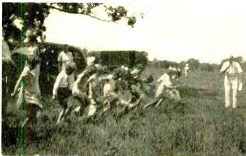
The signal flies and they're off to a fine, high-stepping start.