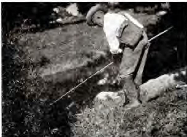
The Latch String proprietor investigates the sunfish situation.