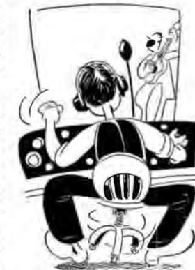
"He should throw away his pick and get a pick-axe."

Home: be it ever so humble, it's no place to grumble.