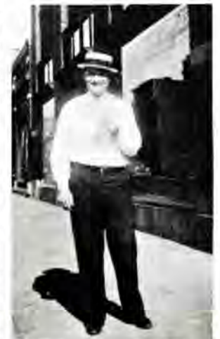
Max Terhune, the Hoosier Mimic and sleight-of-hand expert extraordinary. If you'll step close, like as not he'll take a hard-boiled egg out of your vest pocket.