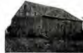
Many a runaway slave covered in this old barn which was one of the stations on the perilous "underground railway" trip.

The barn shown above is the same barn, its stout hewn oaken timbers having withstood the storms and weather for nearly a century now. Inside, quaking with fear, many runaway slaves were hidden under the