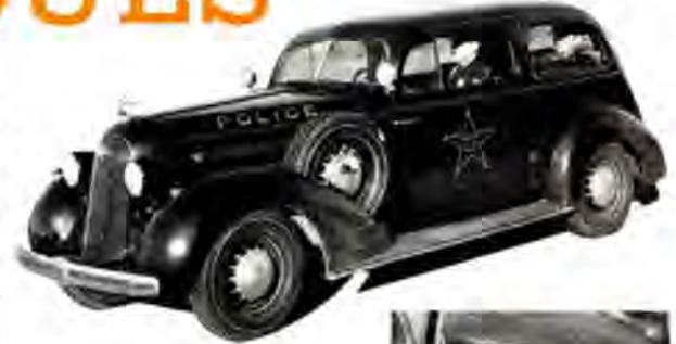
These pictures of specially equipped cars show how Cook county is combining speed, first aid and radio in an effort to reduce the death and accident toll throughout the county.

Another great advantage in the cruising radio ambulances is the fact that the squad can usually reach the scene of a highway accident in time to keep traffic moving and thus avoid dangerous congestion. Scores of cases are on record which show that additional lives have been lost after the original accident because motor-