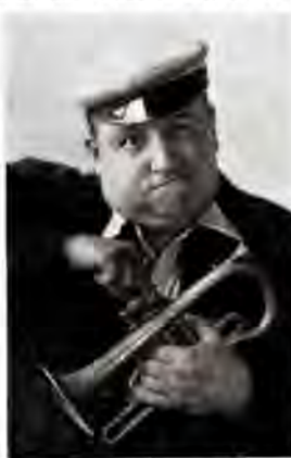
"That darn middle plunger has been sticking for weeks."