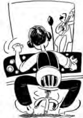
"What a fine place for old razor blades."

Nothing rusts faster through disuse than one's sense of duty