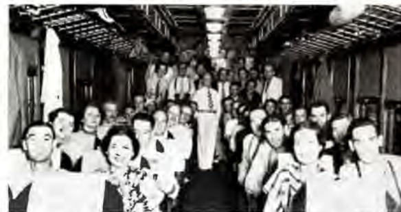
Here is a large group of your friends just after they boarded the steam cars for the trip to Springfield and the Illinois State Fair. Air conditioning in their private car made them forget torrid temperatures outside. We can't dope out a way to print all the identifications under this cut, so we'll see how many you can call by name.