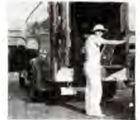
Tommy Rowe, at the rear of the station's new mobile transmitter truck, shows what the well-dressed young radio engineer will be wearing in the line of hat styles.