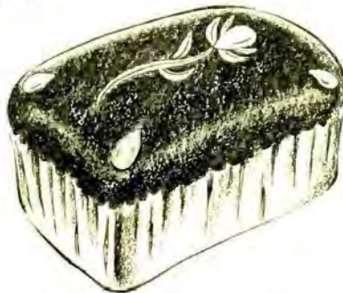
Art Page endorses this'n . . .

gredients together several times and add to the above mixture alternately with currant juice. Then add the fruit. Mix well. Bake three hours in a very slow oven, 275 to 300 degrees F. This makes four 2-pound loaves of fruit cake.