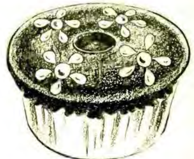
. . . 'n' this'n, too.

If your currant juice has been sweetened, decrease the amount of sugar called for in the recipe. Other fruit juices such as sweet cider, grape juice, raspberry or mixed fruit juice may be used.