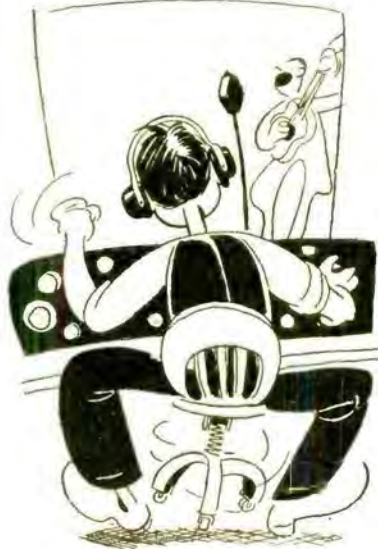
"Some day I'd like to take a trip through the Grand Canyon."

Two announcers will turn tourist for the program and will describe such interesting museum exhibits as Colonel Lindbergh's plane, "The Spirit of St. Louis," in which he flew the Atlantic; the horse-drawn carriages used by Presidents Theodore Roosevelt and Wilson and the first steam locomotive used in this country.