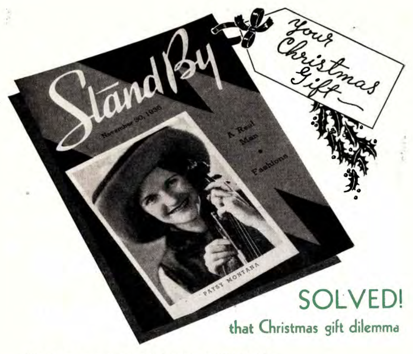
The Answer—a year's subscription to STAND BY!

STAND BY as a gift exemplifies the Christmas spirit. It is friendly, helpful, wholesome—just the sort of personalized radio magazine you and your friends enjoy most. And, for value received, your gift of a STAND BY subscription can't be beat. Actually it's 52 gifts in one—one for each week in the year.