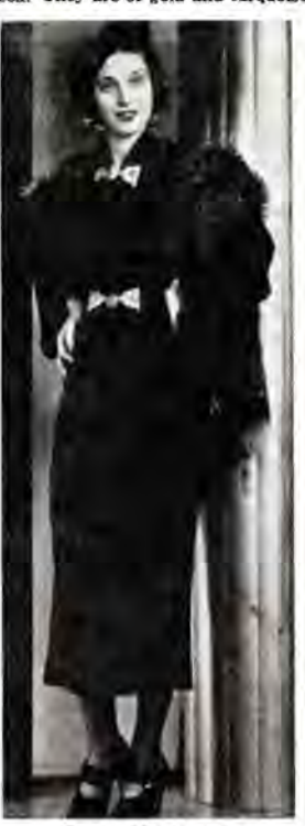
No overalls for her.

The costume I'm wearing in the accompanying picture is a comfortable all-occasion outfit. The dress is made of black embroidered crepe, trimmed with a butterfly buckle at the waist, matching the clasp at the neck. They are of gold and turquoise