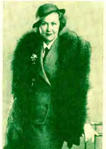
Tailored for the street.

T AILORED clothes always have been my favorite for street wear, so I'm glad when mannish suits are fashionable as they are these days. I went to an advance showing of woolen suits by Creed of Paris the other day, and this amazing French couturiere even carried the