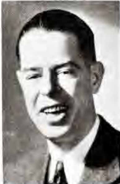
Uncle Ezra without his whiskers.