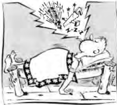
A good prospect for Bill Putt's world-shaking invention.

At last night's cowboy club meetin' a resolution were passed to erect and build a club-house for to gather 'round in hereafter. There are three reasons for such a projeck. 1. The Big Boss' wife have objected to any more such goin's on in the bunkhouse where we have been meeting until now. She claims the singin' aint so good and the speech-makin' and ar-