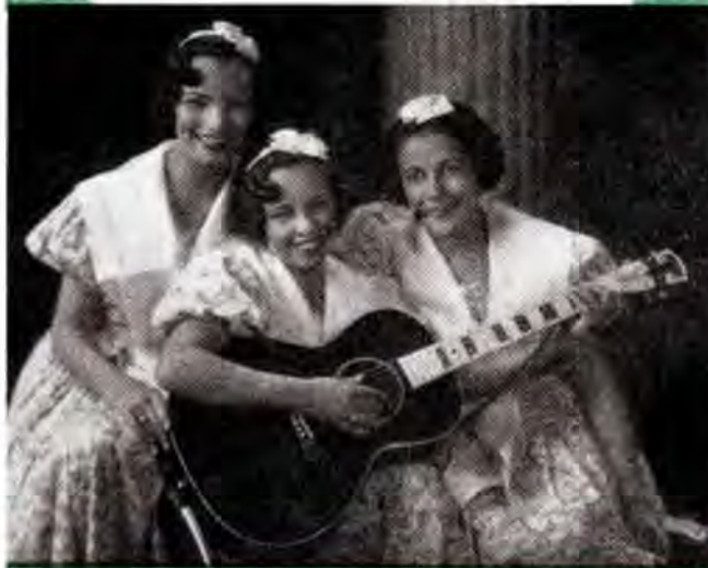
Window Shopping, Skiing, Skating Among Road Shows' Pastimes