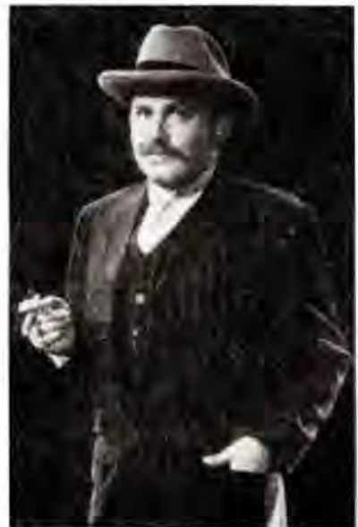
YOWSAH, it's the Old Maestro, Ben Bernie, all tricked out for a recent "Gay Nineties" broadcast.