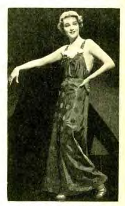
She's no comic valentine

When this picture was taken, I had on a jade green taffeta evening gown. The dress is really made along very simple lines as you can see, but the