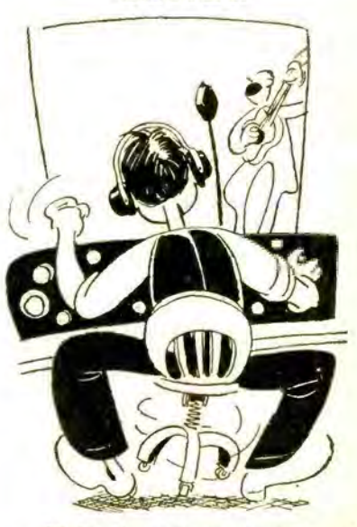
"Well, it may go 'round and 'round but that certainly ain't music comin' out there."