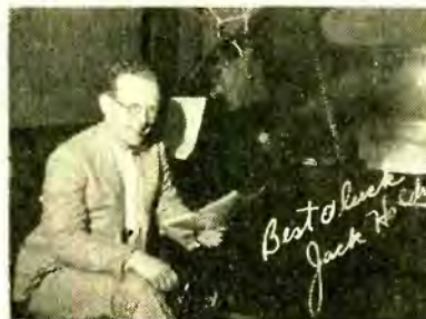
He's a shrimp fancier.